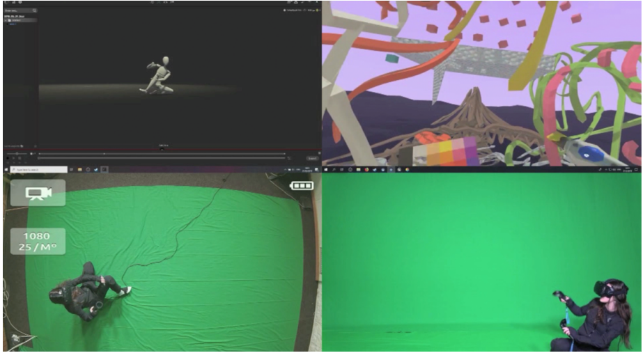
Figure 1. Empirical stage documentation process of Disembody project.

Beta 7 - present imposed or allowed privilege of movement at different degrees, diverse types of natural or artificial interaction with the environment, fluctuations in complexity of geometrical representations and diversified narrative contexts. Thus, through contrasting different engagement interactive scenarios experienced by the participants, a varied body-movement patterns were revealed for each participant and for each case study (Figure 1).