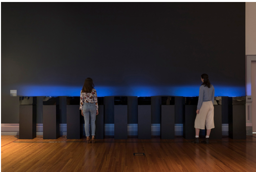
Figure 5. 10 Kinds of Fog , photographed by Mark Ashkanasy, image courtesy of little wonder, 14 Sep. 2018

10 Kinds of Fog , on the other hand, presents fog as a quasi-thing: a structured, material phenomena in itself, a carrier of information about the behaviour of the air, and a colourant of experience (Griffero, 2017). Whereas the aforementioned works are architectural in scale, 10 Kinds of Fog was akin to bonsai, contained to an uncovered 40x40x10cm space atop each of the ten black boxes. Just as bonsai draws one's attention to otherwise unnoticeable qualities of a tree, 10 Kinds of Fog's diminutive size lifted the viewer above the phenomena, and foregrounded formal and textural qualities that are not readily apparent. Yet, being uncovered, 10 Kinds of Fog enabled the audience to interact with it, as it flickered, evanesced and returned in response to the waving of hands or blowing of breaths, as they, too, found fog .