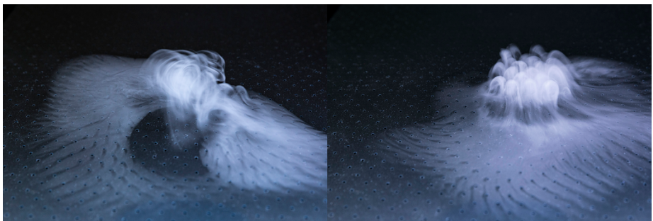
Figure 4. 10 Kinds of Fog , photographed by Mark Ashkanasy, image courtesy of little wonder, 14 Sep. 2018

Artists and designers have turned to fog alongside other quasi-things in the past. In the late 1950s through the early 1960s, Yves Klein engaged energy and phenomena to produce works in which he was no longer completely the author, but the phenomenon itself was an active participant, as in his proposing an “architecture of the air” composed not of walls and roofs, but of air, fire, and water - phenomena that were ephemeral,