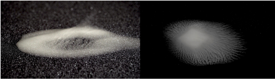
Figure 2. 10 Kinds of Fog , image courtesy of little wonder, 7 May. 2017