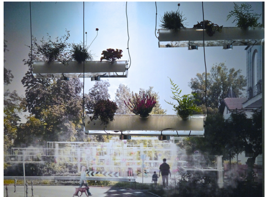
Figure 1. Fog Garden, image courtesy of little wonder, 18 Sep.2014

As we wondered about recirculating the fog, we also wondered about giving the fog form. In experiments with recirculating fog - involving an outlet for the fog and a suction inlet for recirculation - we came across particular challenges: if the outlet and inlet were close enough together for optimum recirculation, the plants did not benefit, while if the outlet and inlet were far enough apart for the plants to benefit, the fog would disperse into the air, rather than recirculate. Meanwhile, the fog seemed reduced to merely a technological fluid, lacking the percolating vitality that had made it so captivating in the exhibition prototypes. It seemed that as we gained greater precision in controlling the fog's movement, direction and volume, we diminished fog's own atmospheric allure, for the more we controlled it, the less it seemed like the captivating phenomena that fog is.