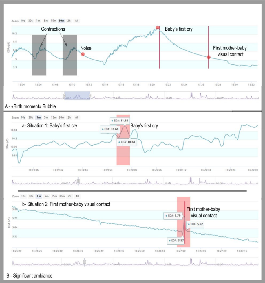
Figure 2. Birth moment bubble and significant ambience, Ichraf Aroua, 2018

according to WHO the recommended threshold is not to exceed 45 dB(A). It informs us about the quality of the space. The delivery room is located just in the entrance of the reception which is a crowded space full of sounds (conversation, movement of medical staff, equipment ...) and equipped with a monitoring whose sound is high so that midwife supervises the woman from a far. For the second peak, the woman complained about the noise coming from the reception; she said: “they picked up their noises, it causes me headaches”. The sound level in this moment is about 64 dB(A). The monitoring is closed after the birth. In both moments the door was open.