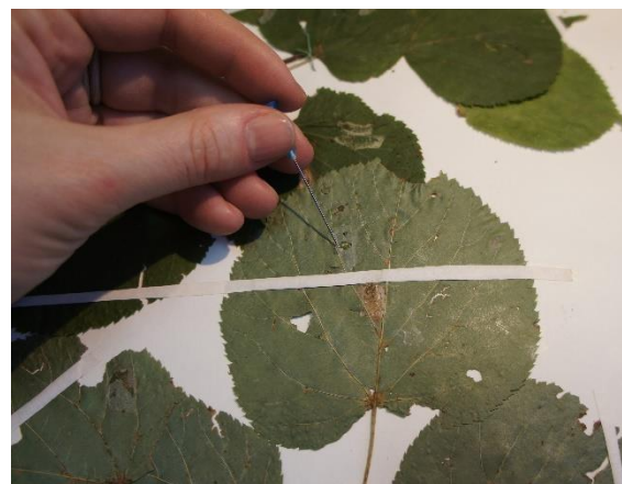
Figure 2. Sampling archival larvae and pupae of leaf mining insects on the pressed leaves.

With the permission of the herbarium curator, the leaf mines containing larvae or pupae were opened to sample insect individuals (Figure 2).