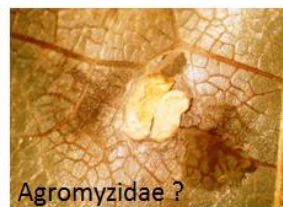
Figure 3. Archival leaf mines of insects from different orders found on the pressed leaves in the herbarium collection from the Palearctic.

The order Lepidoptera was represented by the leaf-mining insects from seven families: Gracillariidae ( Phyllonorycter , one morphospecies), Nepticulidae ( Stigmella , probably three morphospecies), Incurvariidae ( Incurvaria , one morphospecies),