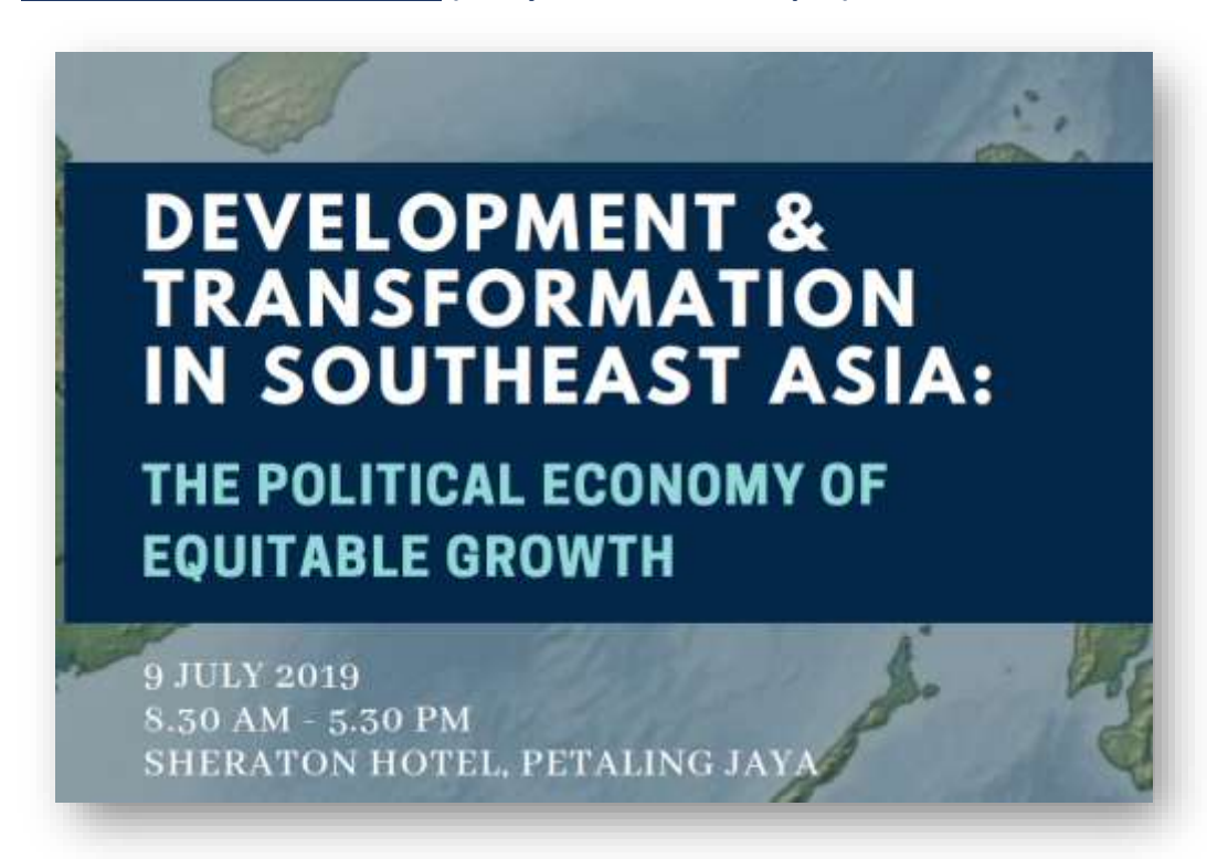
Day 1: 9 July 2019

DEVELOPMENT & TRANSFORMATION IN SOUTHEAST ASIA: The Political Economy of Equitable Growth