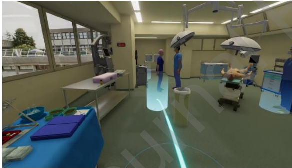
Figure 2- Photo of an error