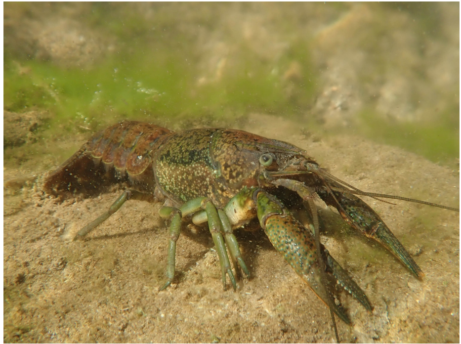
Figure 2. Procambarus virginalis trapped in pond 1. Photograph by Marc Collas.

and subsequently sequenced according to the Big Dye terminator method (PE Applied Biosystem, USA) on an ABI PRISM 3130 automatic DNA sequencer (PE Applied Biosystem, USA). For each individual we sequenced both forward and reverse fragments. All sequences were aligned with Geneious 10.1.3 ( https://www.geneious.com ) and blasted in GenBank to confirm the identity of each specimen ( https://blast.ncbi.nlm.nih.gov/ ).