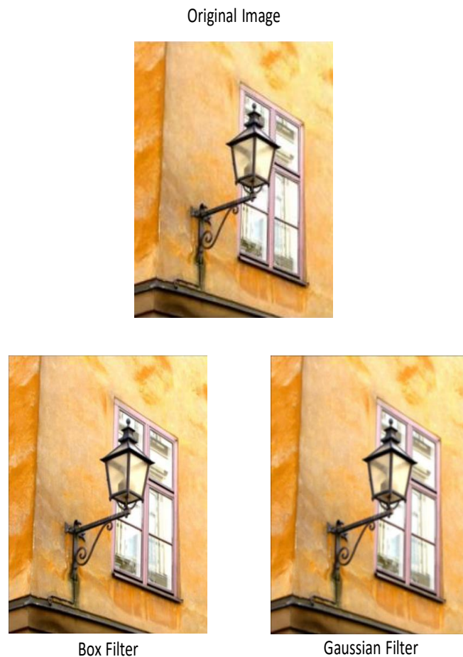
Figure 1. Filtering results of box and Gaussian filters.

Such a filter is very hard to be analyzed because it is nonlinear. It is slow but it has got some accelerations as well. The approximation is so fast in this method because of its nonlinear nature. It cannot be used for sharpening, it can just blur the image to reduce the disturbing noise. Figure 1 shows the filtering results of box and Gaussian filter. Figure 2 demonstrate the results of bilateral filtering for different sigma values.