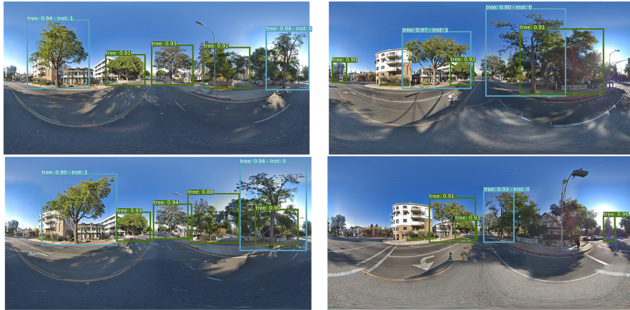
Fig. 3. Sample results obtained on the Pasadena dataset for multi-view object detection and re-identification. Trees were correctly detected (green) and further accurately re-identified across different views (cyan) when possible.

Acknowledgment: This project was supported by funding provided by the Hasler Foundation. We thank Mapillary for providing the dataset.