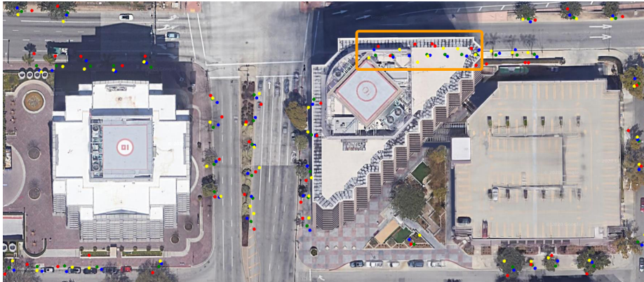
Fig. 5. Sample of geo-localization results for Pasadena comparing different methods. Green, blue, yellow and red circles represent the ground-truth, GeoGraph, SSD-ReID-Geo and MRF respectively. The orange bounding box exhibits how ground level imagery can be helpful to detect object obscured by buildings from aerial view.