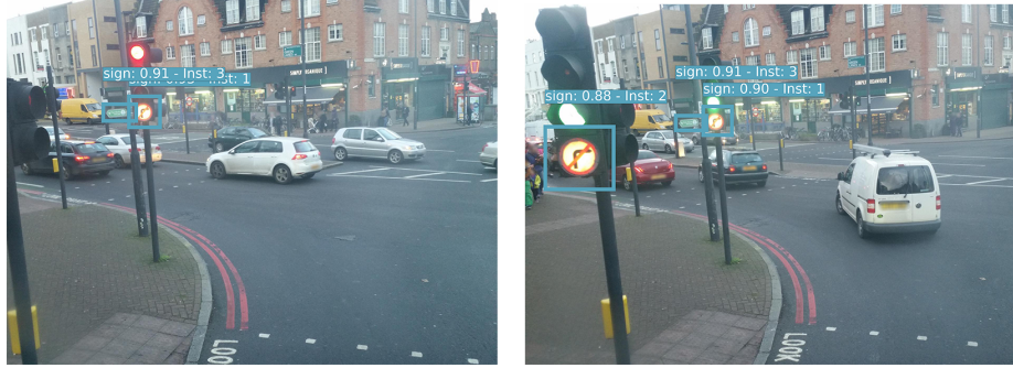
Fig. 4. Sample results obtained on the Mapillary dataset for multi-view object detection and re-identification. Here all detected objects (signs) were both detected and further re-identified (cyan) due to the higher similarity between views.