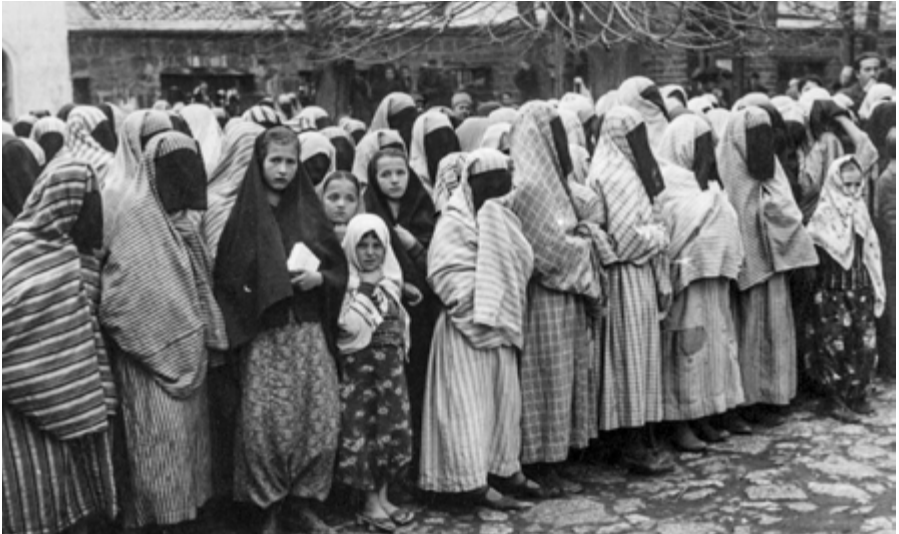
Figure 39: Mourners at Mehmed Džemaludin Čaušević's funeral in March 1938.