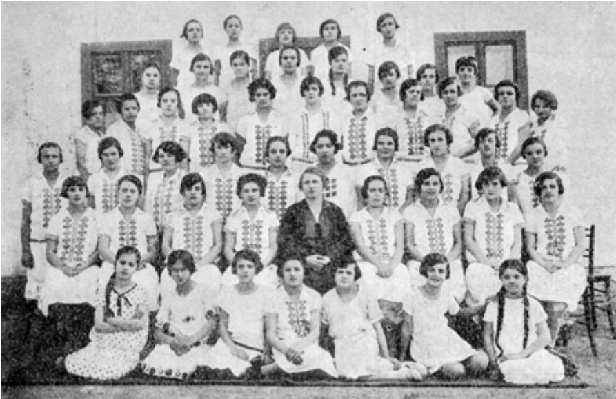
Figure 22: Gajret's female student dorm in Mostar, early 1920s.