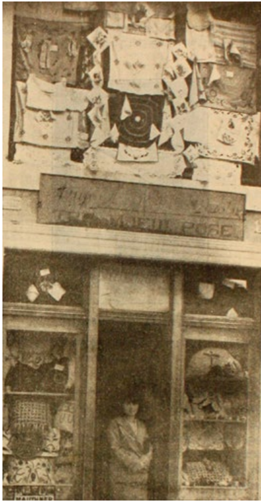
Figure 27: Displaying the prizes collected by Gajret Muslim women activists for a zabava raffle in Stolac, 1931.