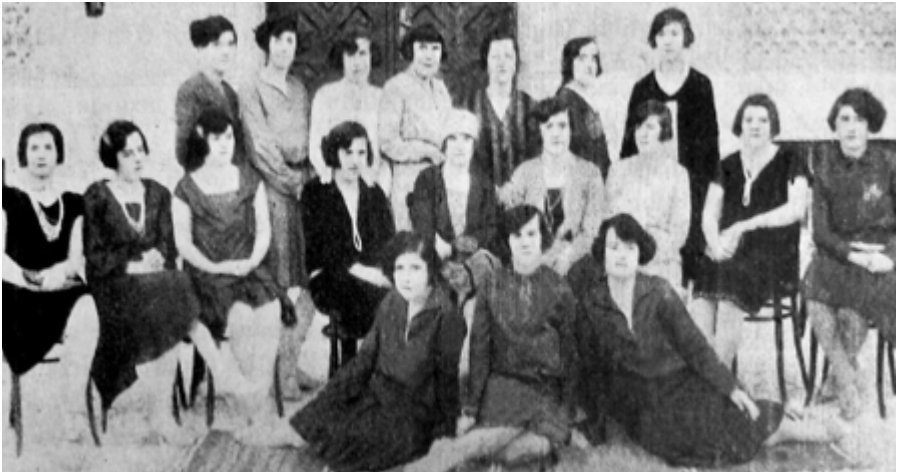
Figure 26: Gajret temporary party branch from Mostar, 1928.