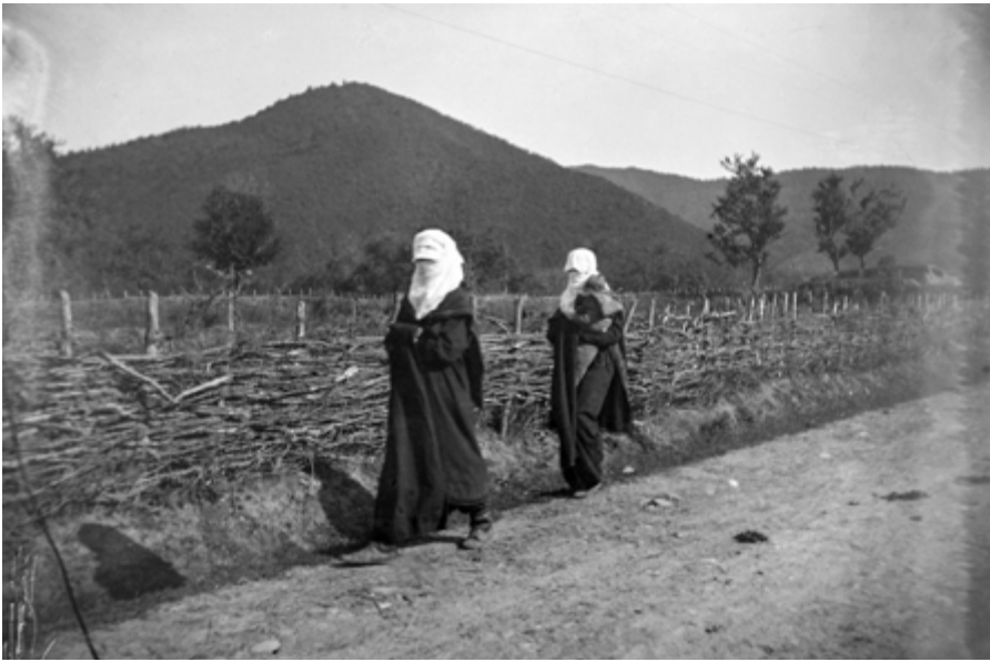
Figure 6: Bosnian Muslim women, undated.