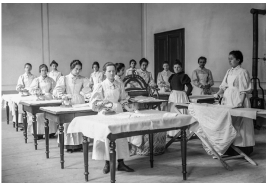
Figure 8: Sarajevo Girls' School, turn of the century.