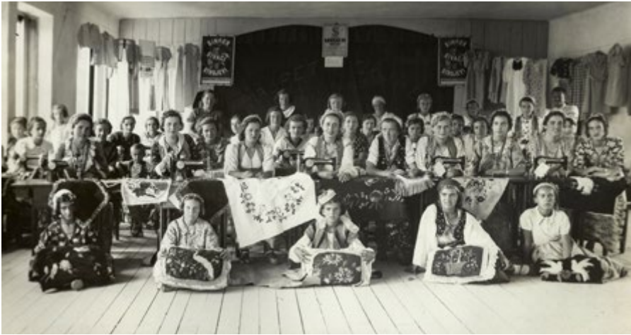
Figure 23: A Gajret sewing class in Trebinje, late 1930s/early 1940s.