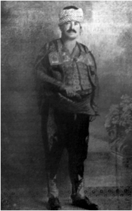
Figure 32: Performing the past.