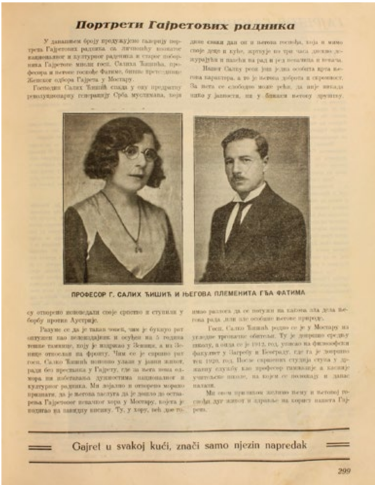
Figure 20. A gendered portrait of activism.