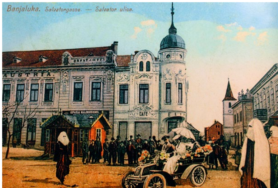
Figure 1: Postcard depicting Banja Luka, circa 1910.

The traveler passing through the Bosnian town of Banja Luka circa 1910 could choose from a wide range of postcards to send home. While a considerable number of these cards depicted diverse aspects of the region's rich cultural heritage—picturesque villages, ruined fortresses, men and women dancing in folk costumes—others showcased the newly-built infrastructure that was becoming an increasingly prominent part of the Bosnian land-