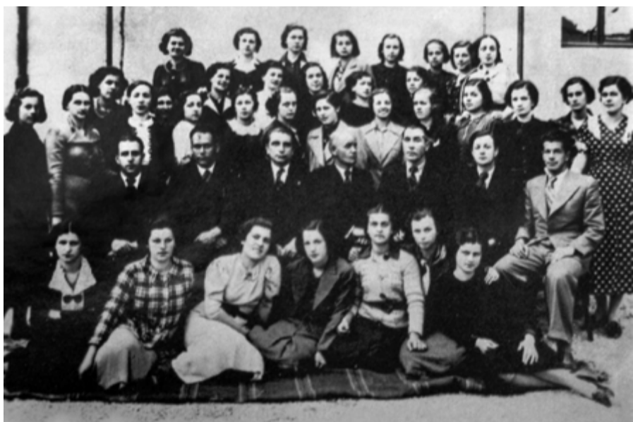
Figure 35: Self-portrait of Gajret's Library in Mostar, late 1930s.