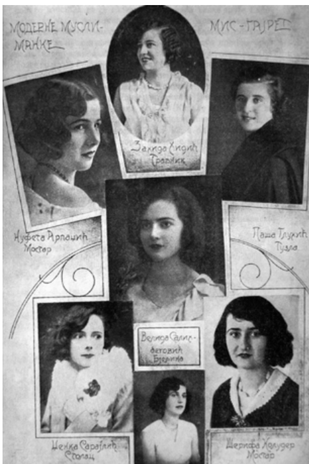
Figure 34: Disseminating modern beauty: Miss Gajret winners from different Bosnian towns.