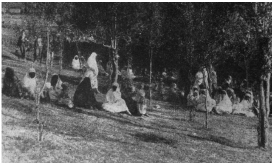
Figure 24: Early twentieth century teferič .