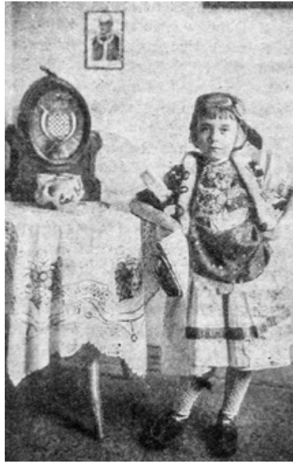
Figure 33: Performing the past. Source: Novi Behar , no. 12–14 (1936–1937): 175.

A unique moment for displaying new standards of Muslim physical femininity within the party ritual, and which deserves special attention, was a practice that spread in Muslim cultural associations, and in Yugoslav society more in general, during the interwar period: the female beauty contest. The story of this practice has been widely studied in the United States, where it is commonly accepted to have been established in the mid-nineteenth century. 84 It spread in particular during the 1920s to Europe, and also beyond to Turkey and Japan. 85 This practice, almost entirely conceived by men, has been severely criticized by second wave feminism as a tool for objectifying women—and this criticism is certainly true. However, as stressed by Hol-