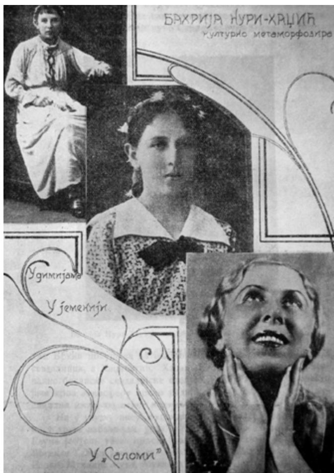
Figure 30. Bahrija Nuri Hadžić's Cultural Metamorphosis, collage.