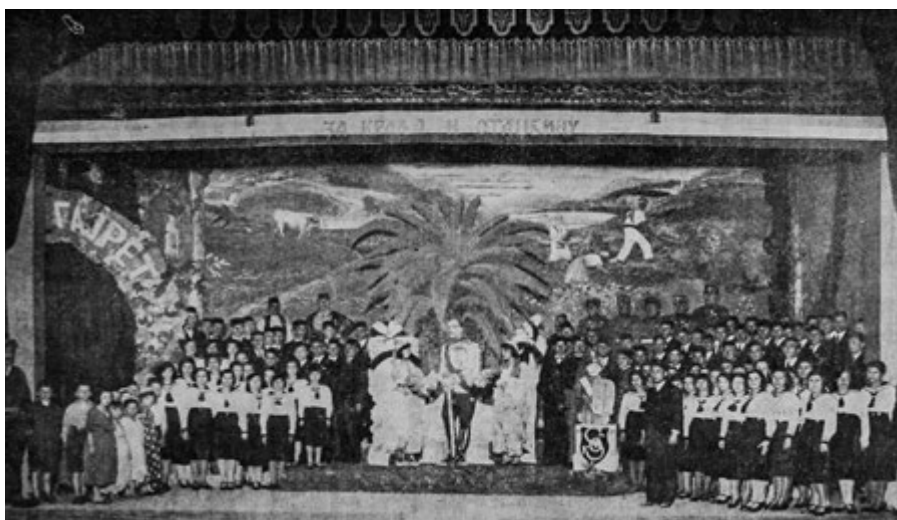
Figure 28: Choreographed performance entitled “For the King and the Homeland,” held at a Gajret party on March 7, 1931 at the National Theater in Sarajevo.