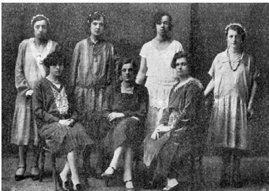
Figure 17: Gajret's female chapter in Bihać, 1921.