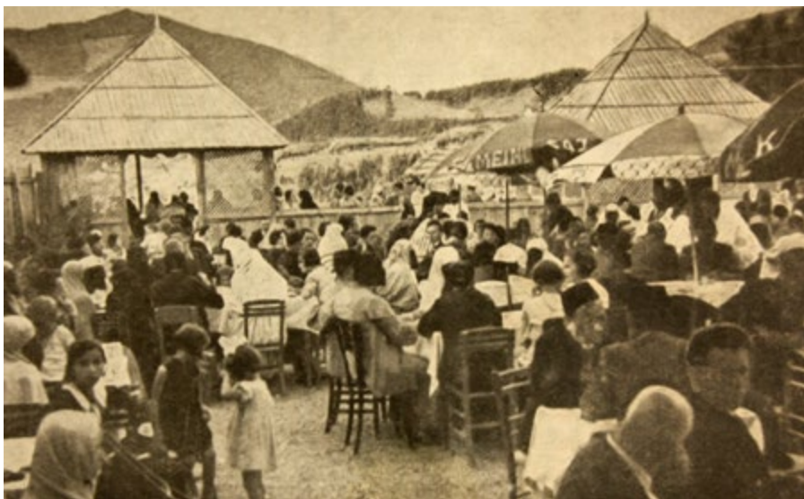
Figure 25: A Narodna Uzdanica teferič in Kiseljak, mid-1930s.