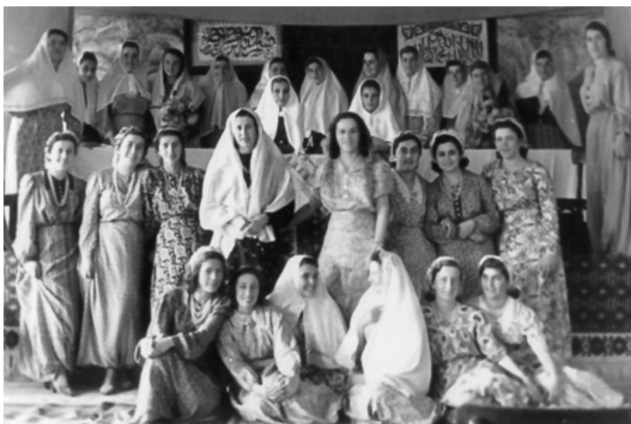
Figure 18: Merhamet's female chapter in Trebinje, late 1930s or early 1940s.

Source: Hamza Humo, Spomenica dvadesetipetogodišnjice Gajreta: 1903.-1928. (Sarajevo: Glavni odbor Gajreta, 1928), 115.