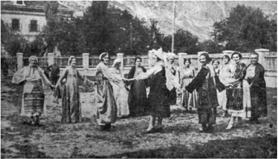
Figure 16: A Panslavic party organized by Kolo Srpskih Sestara in Travnik, in 1928.