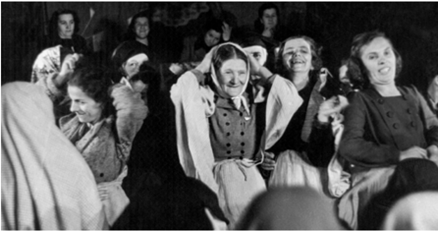
Figures 2 and 3: Muslim women publicly abandoning the headscarf at the 1948 Antifašistički front žena Conference.