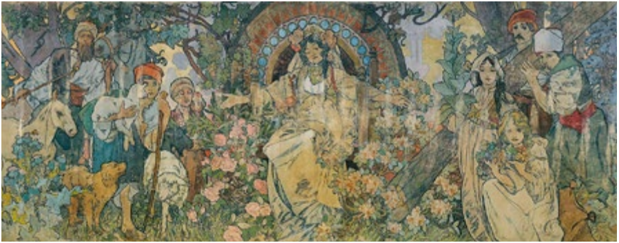
Figure 4: Alphonse Mucha, The Allegory of Bosnia and Herzegovina , 1900, tempera on canvas, Museum of Decorative Arts, Prague.

its center an allegory of Bosnia and Herzegovina. As eloquently highlighted by Edin Hajdarpasić, “Mucha’s centerpiece was a grand Art Nouveau rendering of the Habsburg imperial fairy tale, depicting a Bosnian Sleeping Beauty roused from centuries of sleep by wise imperial governance” 29 (see figure 4).