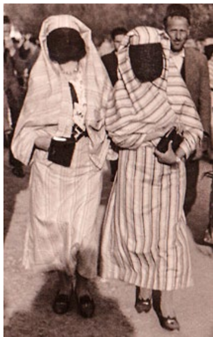
Figure 40, 41, 42: Muslim women from Sarajevo, 1930s.