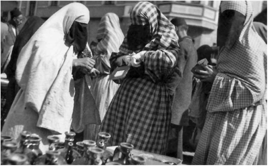
Figure 38. Muslim women doing shopping in Sarajevo's market, interwar period.