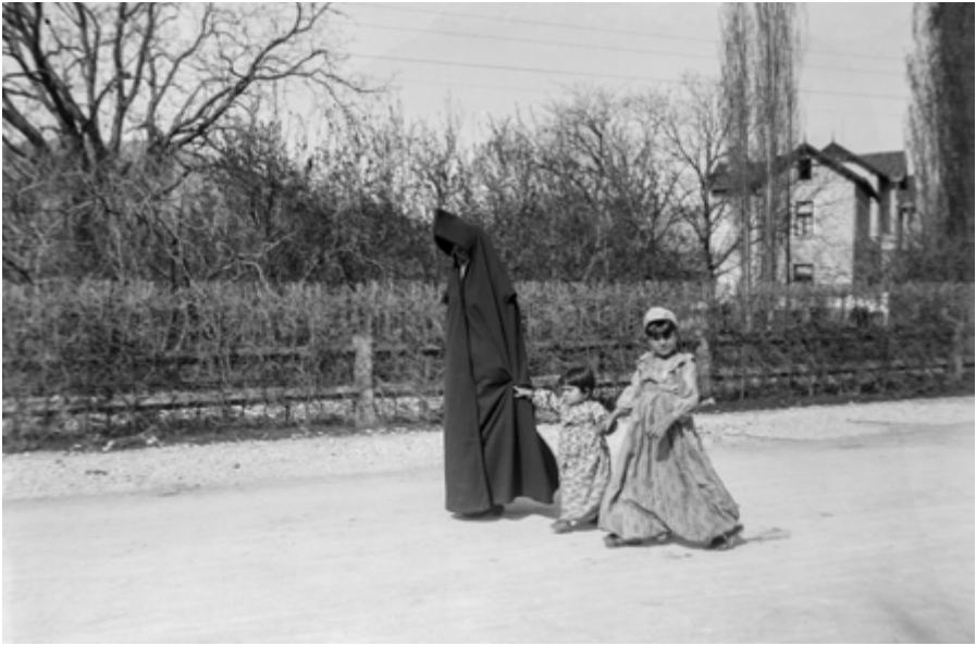
Figure 5: Muslim woman wearing a feredža in Mostar, 1904.