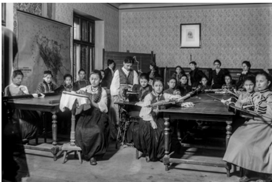
Figure 7: Interior of the girls' school in Sarajevo, with students dressed in traditional clothes, 1906.