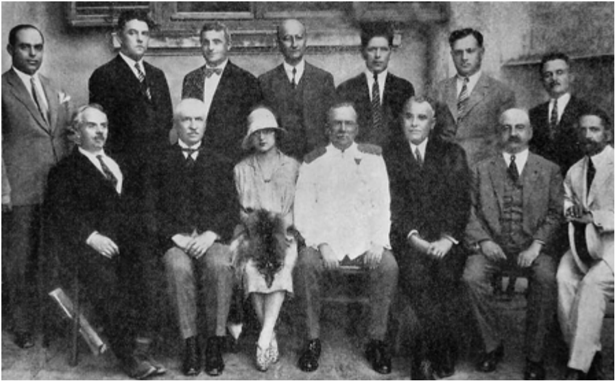
Figure 15: The Central branch of Gajret Osman Đikić in Belgrade.