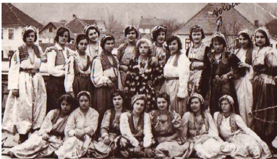
Figure 29: Gajret women's choir from Banja Luka, late 1930s.