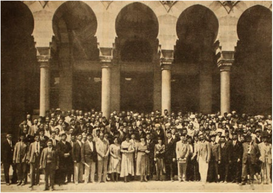
Figure 21: Delegates to the yearly Gajret Assembly in Sarajevo, 1931.