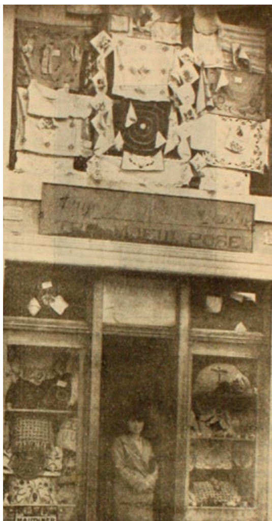
Figure 27: Displaying the prizes collected by Gajret Muslim women activists for a zabava raffle in Stolac, 1931.