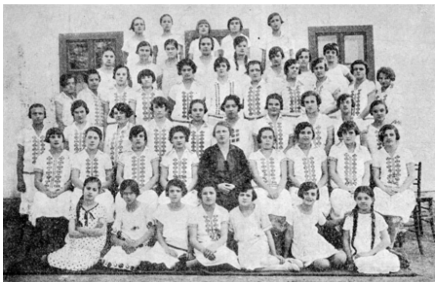
Figure 22: Gajret's female student dorm in Mostar, early 1920s.