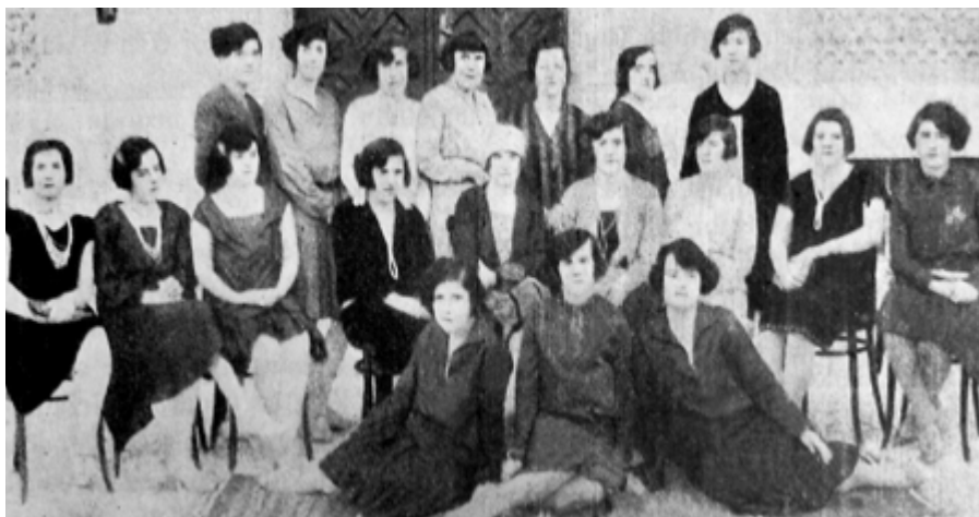
Figure 26: Gajret temporary party branch from Mostar, 1928.