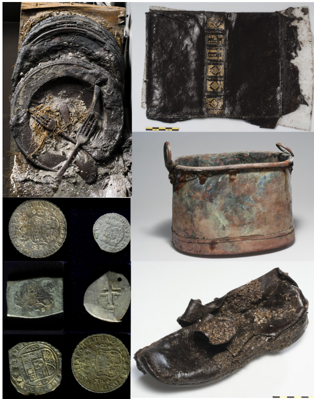
FIGURE 4. SELECTION OF ARCHEOLOGICAL ITEMS.

Two anchors were found about 10 m east of the hull. Marine Sadania et Christelle Chouzenoux (2010) conducted their studies. They are characterized by wood stock (now gone) and the presence of rings. Their theoretical weight was estimated using total length depending known for warships tables. Thus the weight of the smallest (1.52 m) would be about 110 French Livres and the largest (3 m) of 884 French Livres (Sadania et Christelle 2010). Once again, the archives complete the excavation data gathered until now, and provide information on a third anchor. The latter, abow anchor, logically position the poop of the ship, weighed about 1,400 French Livres to 3.30 m-long. It is part of pieces recovered by salvors during the winter of 1756 (ADH 4 B 302, and 5 M 96). The removal of the two anchors found on site in 2010 revealed unusual cables linking them to the ship. The cordage composition and their extension under the sand in the direction of the centre of the hull leads Damien Sanders (2012) to attribute their presence to salvage operations of the masts in 1756. Once cut, the rigging was carried by the current until the anchors arrested it. It is believed that the rest of the standing rigging should still be found on the bottom (Sanders 2012).