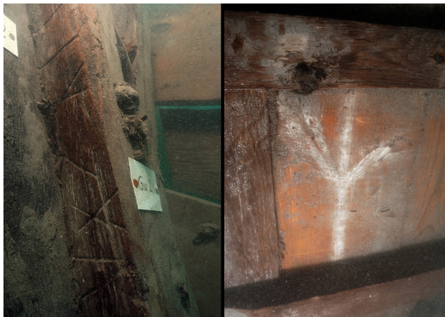
FIGURE 3. ROMAN NUMERALS ON A PIECE OF LOWER CEILING PLANK, WHITE MARK ON THE INNER SIDE OF A CEILING PLANK.

Archives (ADH, 4 B 302, and 5 M 96) document the nature of the cargo loaded in Cádiz: 200 barrels