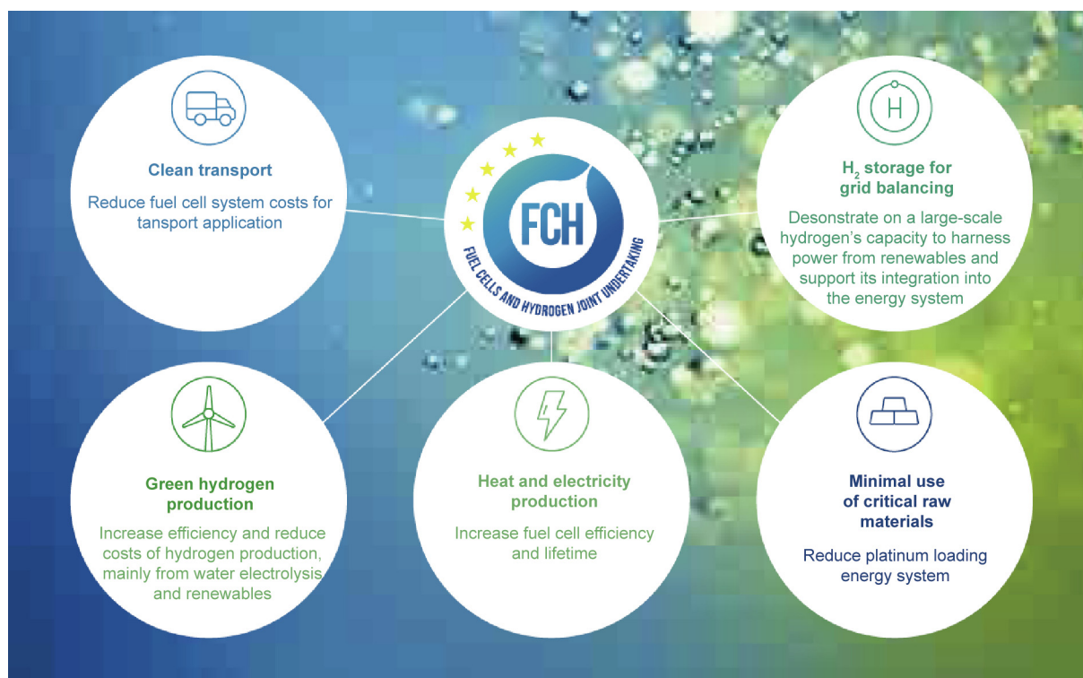
Fig. 3. The core objectives of the FCH-2-JU program [15].

The European hydrogen roadmap establishes as its final target the development of clean hydrogen produced from renewable sources using mainly wind and solar energy. However, clean hydrogen costs are currently considered to be too expensive (at 2.5–5.5 EUR·kg -1 ), as compared with the hydrogen currently produced from fossil fuels (at 1.5 EUR·kg -1 ), and intermediate solutions (e.g., fossil-based hydrogen with carbon capture and storage, with an estimated cost of around 2 EUR·kg -1 ) must be considered during the early days of the energy transition. In this context, three phases are defined in the European roadmap: ① 2020–2024, in which the implementation will occur of 6 GW of renewable hydrogen electrolyzers targeting onsite hydrogen production for the chemical sector and heavy-duty transport (buses and trucks); ② 2025–2030, in which the electrolyzer installations will be increased to 40 GW, focusing on hydrogen production for novel markets (i.e., steel making and rail and maritime applications), hydrogen refueling stations, daily or seasonal energy storage, grid balance, local hydrogen networks, and the provision