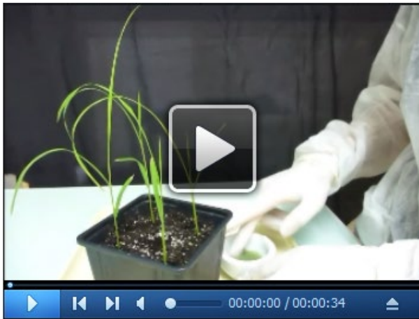
Video 2. Mechanical inoculation of RYMV on rice leaves