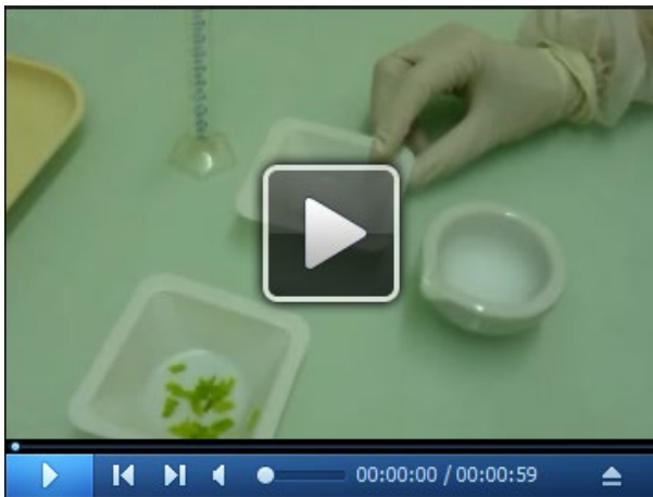
Video 1. Preparation of RYMV inoculum from infected rice leaves