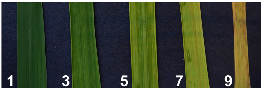
Figure 2. Symptom severity scale on rice leaves