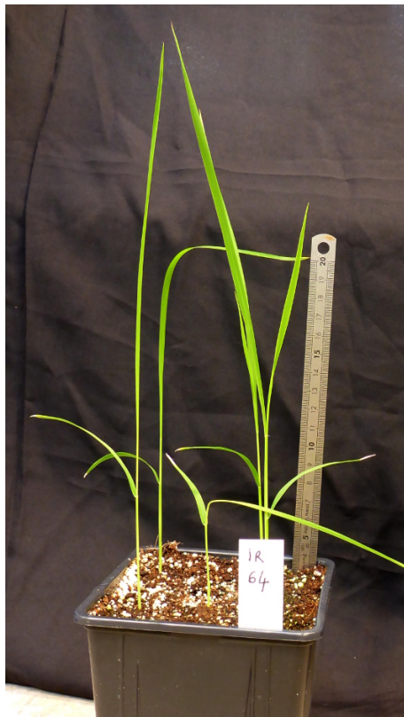
Figure 1. Two weeks old IR64 plants, ready for inoculation