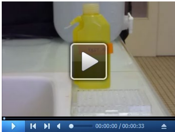
Video 3. DAS-ELISA plate washing

Discard the coating solution from the wells. Wash the plate by filling the wells with 1x PBST using a wash bottle and decant the washing buffer immediately (for a quick wash) or after 3 min. Proceed successively to a quick wash and three 3 min-washes. Remove residual buffer on a paper towel (Video 3).