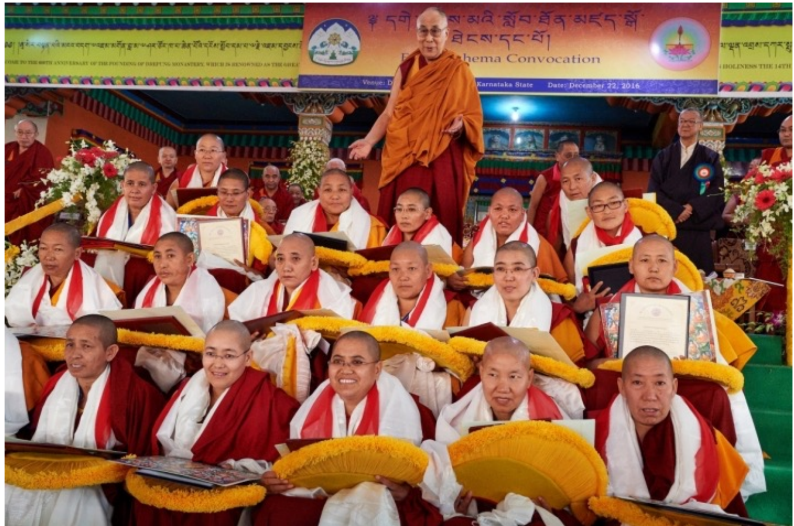
The first 20 geshemas with His Holiness the Dalai Lama during the graduation ceremony in Drepung Monastery, South India (December 2016)