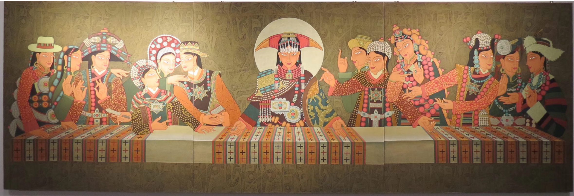
The Last Supper: A Tibetan Feminist interpretation of Da Vinci's work