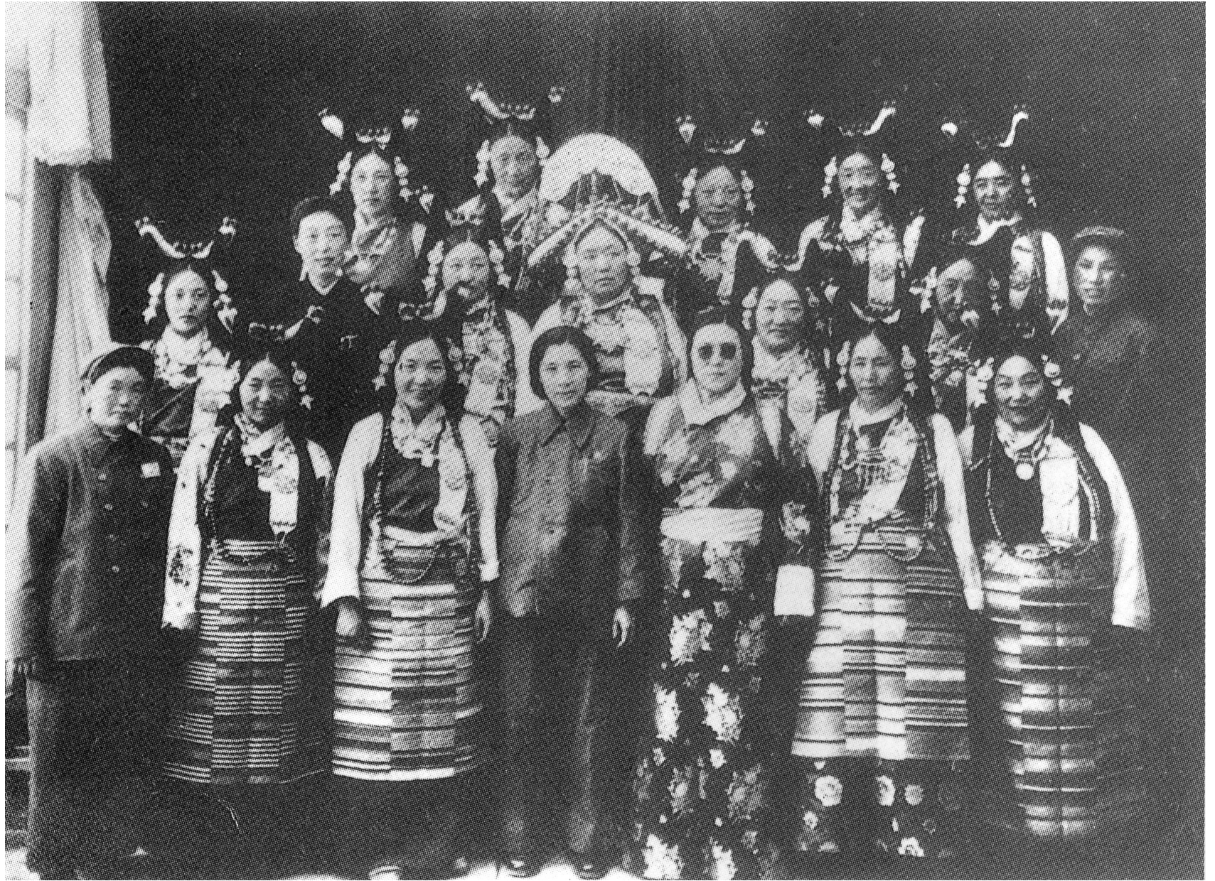
Photo taken during the foundation of the Tibetan Patriotic Women's Association in Lhasa (May 1952?)