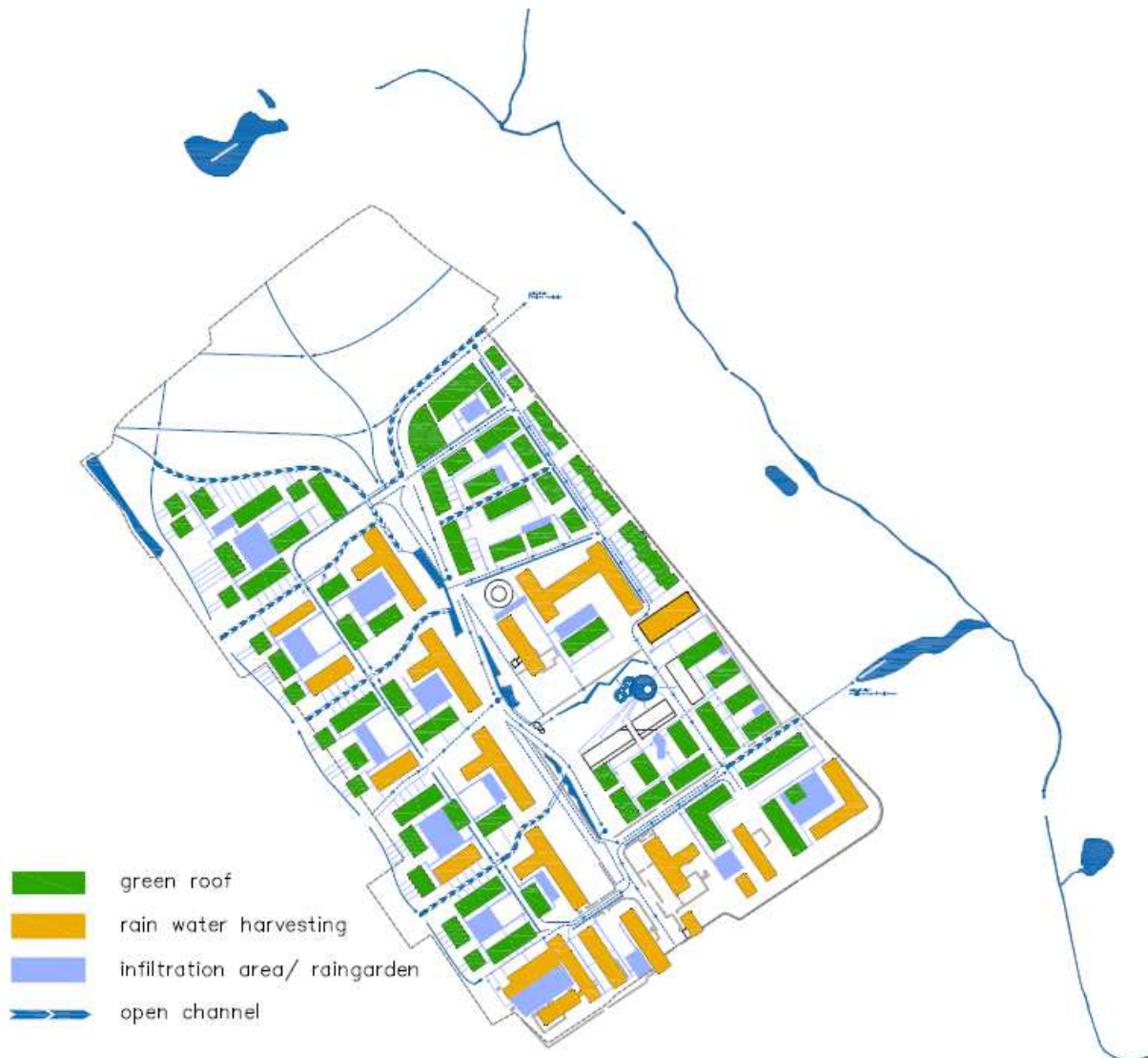
Figure 2 : Illustration of the basic WSUD concept