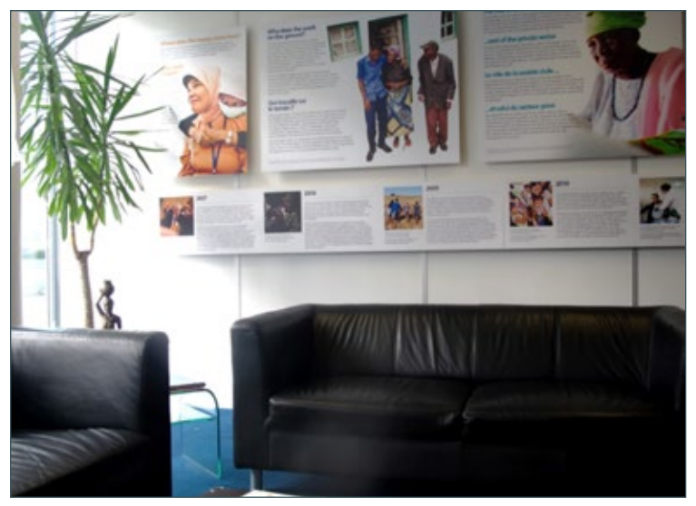
Figure 4: Lobby of the Global Fund

right quadrant of the board, I identified a box of Artequick, the medication used by the FEMSE program in the Comoros that I would come to know very well in my next two research sites.