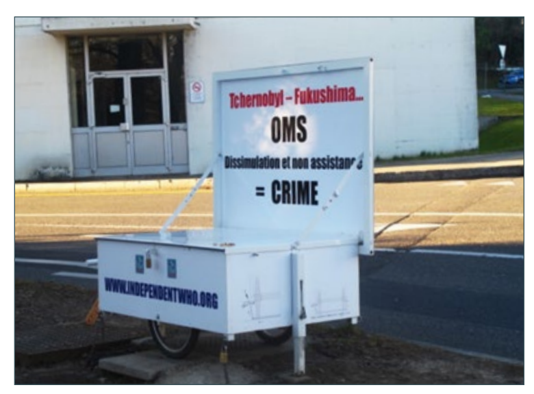
Figure 5: Road to the World Health Organization

organized. Chinese, Indian, Brazilian, doesn't matter. What matters is if they are prequalified. But we would like to support innovative companies, like those in Africa." However, at the time, no companies in Africa had made it through the pre-qualification process, and Global Fund's procurements were dominated by Indian and multi-national European firms like Sanofi and Novartis.