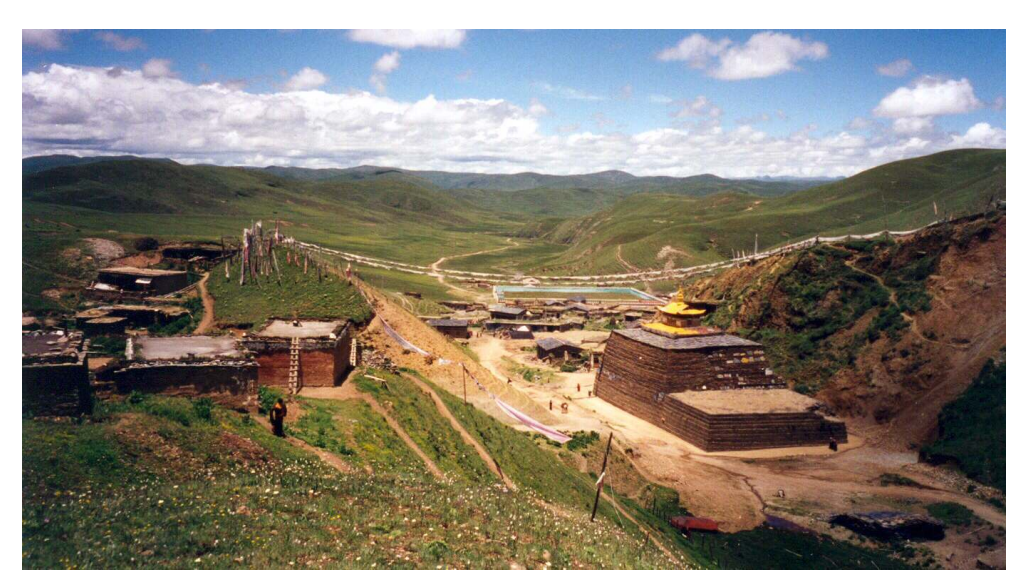
Photo 3. View from the hill above the old temple on the mani-structure and the nomad quarter in Manijango (2003)