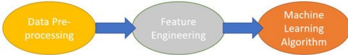
Figure 3. Flow chart for data processing to estimate hydration level

features. In this experimentation, the training data set is 70% and the test data set are 30% of the model. This development of the model is done with 3 fold cross-validation and gives an accuracy 91.3% with a random forest classifier among all other classifiers. Liaqat et al. (2020). Figure 3 shows the main steps of hydration level estimation.