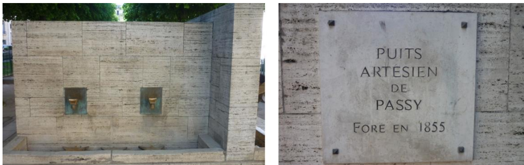
Figure 2 Square Lamartine fountain (the artesian well of Passy in Paris, France)

To both test the reproducibility on regular samples and to allow comparison with another ^{14}\text{C} laboratory, we collected freshwater samples from a fountain of the artesian well of Passy in Paris. Samples were collected in 280- mL glass bottles (Figure 2 and Appendix). As the water does not flow continuously but is stopped with a faucet, we let the water flow for 10 min before sampling and then closed the sample bottles quickly to avoid equilibration with modern \text{CO}_2 . The samples were not poisoned with \text{HgCl}_2 but were stored at 4 °C overnight. \text{CO}_2 extraction was done the following day.