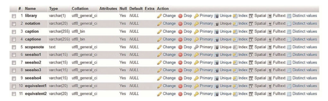
Figure 2. The structure of SciGator database.