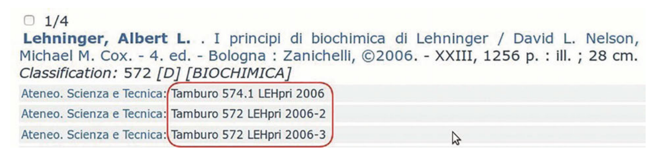
Figure 1. Example of some shelfmarks.

After this reform, it became possible to develop an online tool, called SciGator (http://scigator.unipv.it), that