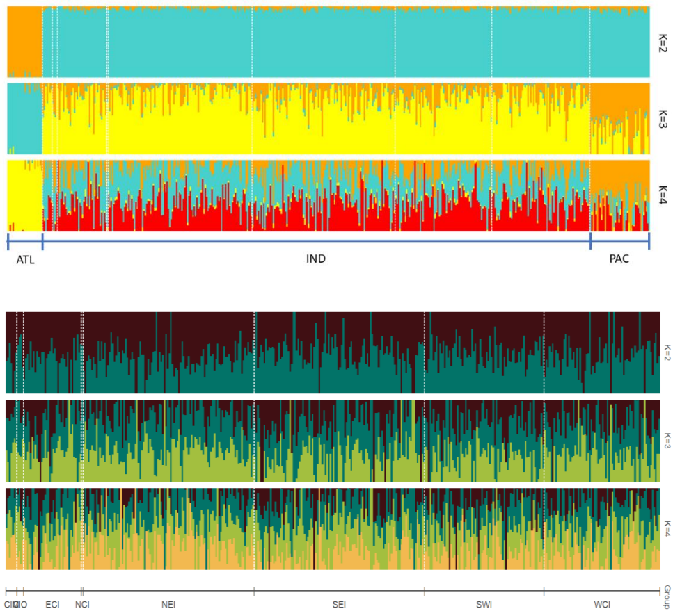
Fig. 3. Individual ancestry proportions estimated by ADMIXTURE when assuming from two to four ancestral populations (K) when including all samples (top) or only Indian Ocean samples (bottom).