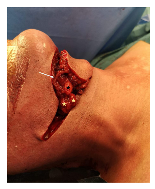
Fig. 2. Appearance of the flap after dissection. Asterisks: lymph nodes larger than 1 cm in areas Ib (black asterisk) and IIa (yellow asterisk). White arrow: submental pedicle.

The incision extends as far as the platysma, starting in the lateral part of the skin paddle (Fig. 2). Careful dissection flush with the deep surface of the platysma muscle must be performed from above downwards in order to widely expose the submandibular region.