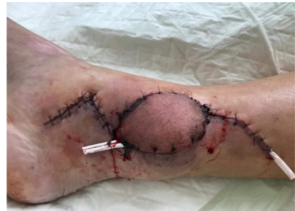
Fig. 3. Medial retromalleolar recipient site before (left) and after (right) submental flap placement. Note the slightly congested appearance of the flap after placement despite tension-free skin closure.

The submental flap therefore comprises lymph node areas Ia (underneath the skin paddle), Ib (without the submandibular gland) and IIa. The submandibular gland is consequently almost totally released and only remains adherent by its inferior edge and partially by its deep surface. The donor site is then closed by sutures after placing a suction drain.