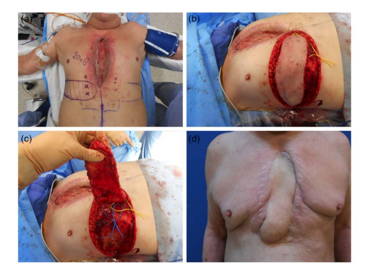
FIGURE 2(a) Preoperative SEAP flap markings with mapped perforating vessels. (b) Intraoperative view of flap harvesting (c) Intraoperativeview of the perforating vessels. (d) Postoperative view at 12 months