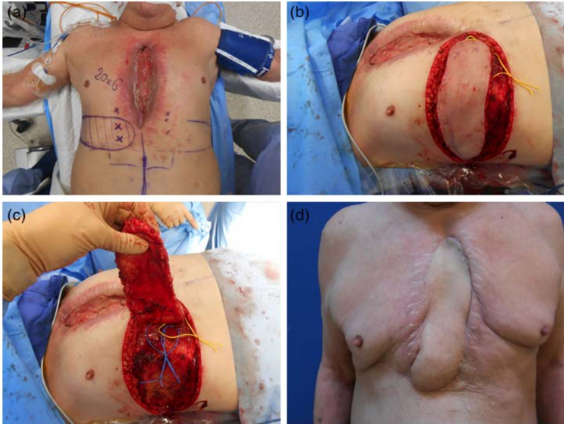
FIGURE 2(a) Preoperative SEAP flap markings with mapped perforating vessels. (b) Intraoperative view of flap harvesting (c) Intraoperative view of the perforating vessels. (d) Postoperative view at 12 months