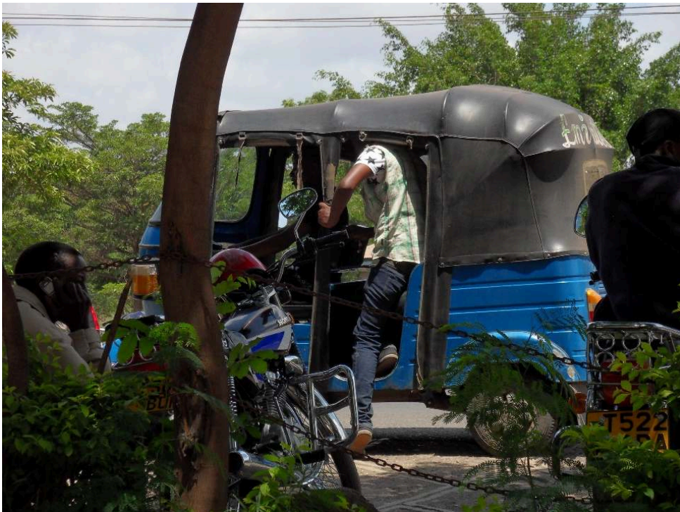
Bodaboda and Touk-touk in Sanya Juu