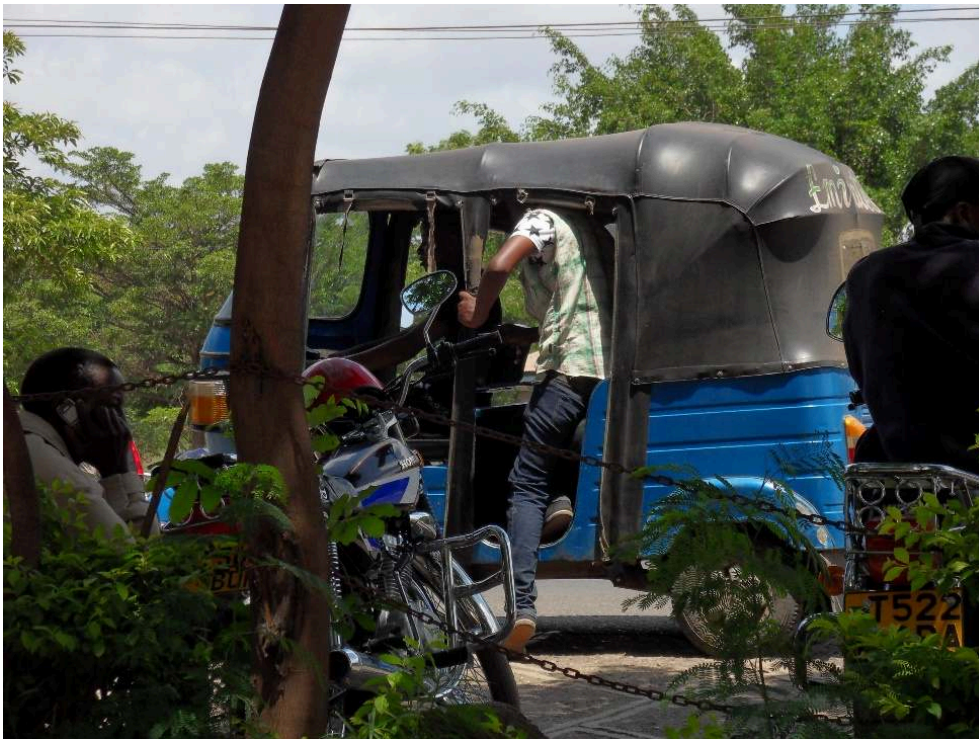
Bodaboda and Touk-touk in Sanya Juu