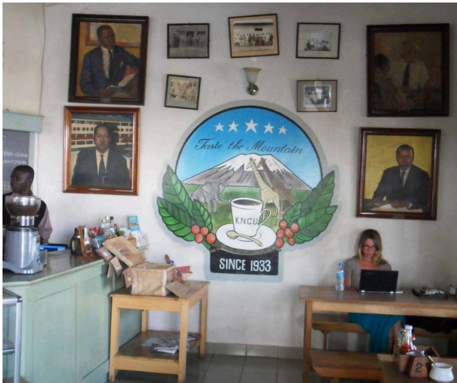
KNCU coffee bar in Moshi