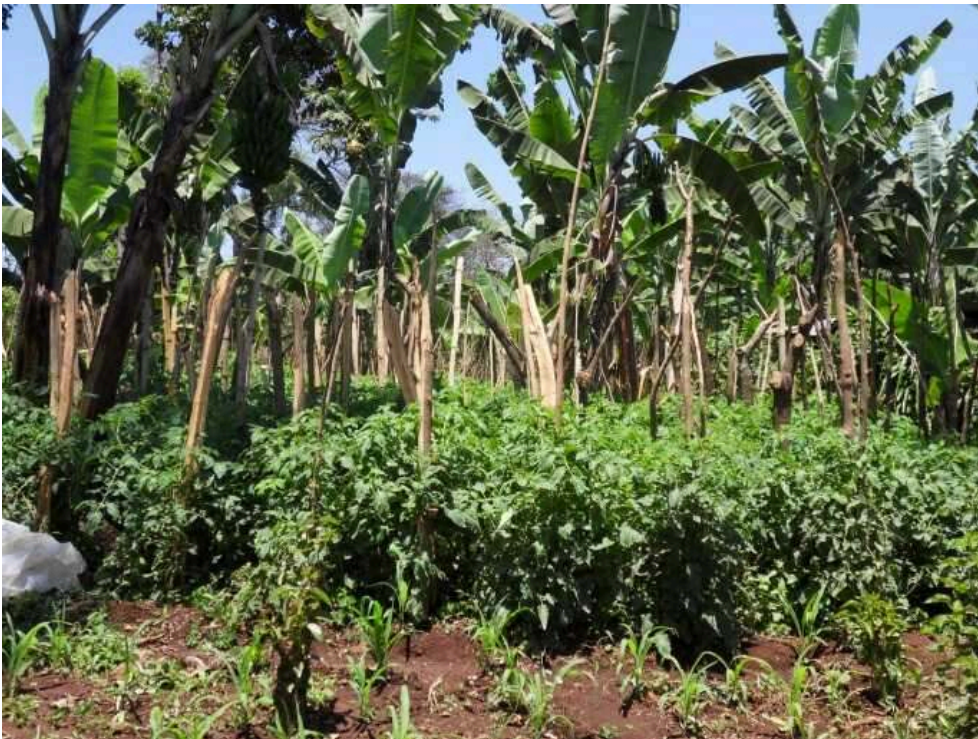
A banana-tomato plot rented in Machame