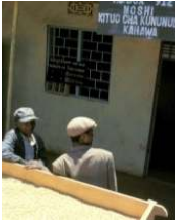
Drying coffee at middleman shop