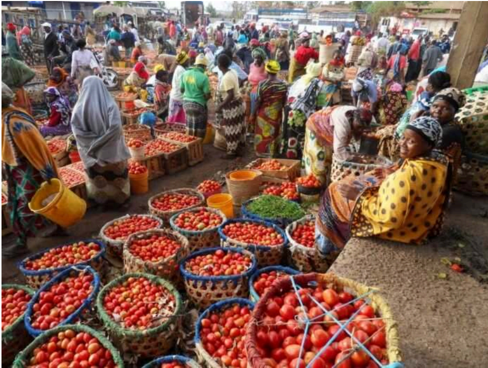
Tomatoes at Kwa Sa Dala market (November 2014)