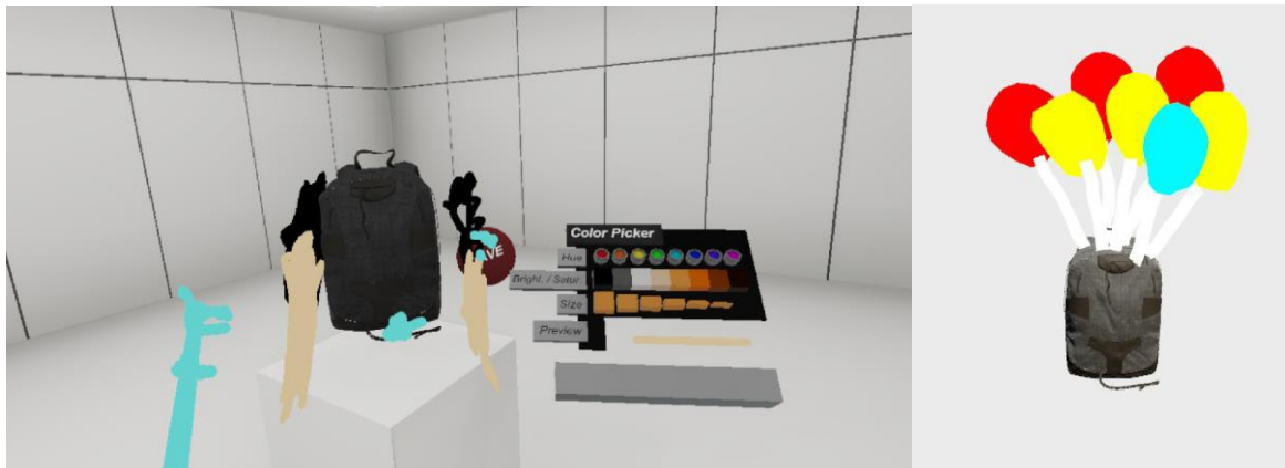
Figure 2. Screenshot of the VR drawing software (left) and example of an idea (right)

complete the Simulation Sickness Questionnaire (SSQ; Lane and Kennedy, 1988), so that we could assess correlations between the two datasets.