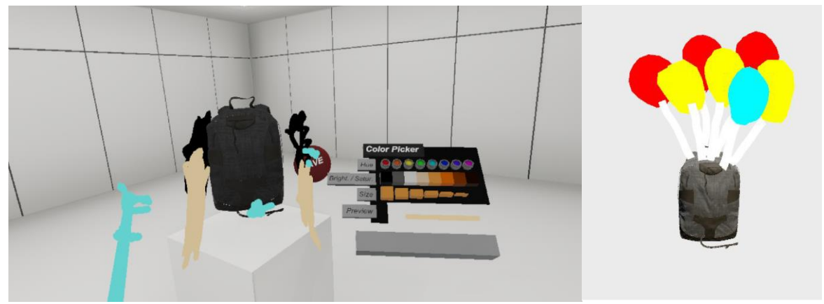
Figure 2. Screenshot of the VR drawing software (left) and example of an idea (right)

complete the Simulation Sickness Questionnaire (SSQ; Lane and Kennedy, 1988), so that we could assess correlations between the two datasets.