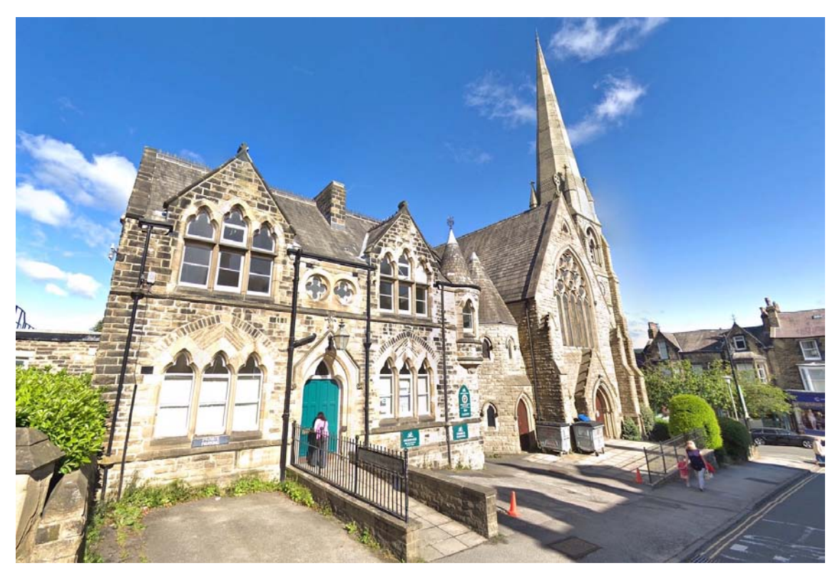
Figure 3. Rudolf Steiner lectures were presented at the Congregational Hall, Ilkley (now Riddings Hall).

The Yorkshire Observer stated: "It is the quiet and peaceful charm of the countryside and the delightful solitudes of its moors which makes the lure of llkley so acceptable to the seeker of health and pleasure, and these moors, with the heather breaking into purple on the crest, are now to be seen in their fullest beauty" (1923b) (Fig.2). The weather for the Conference was "cold and wet" (Steiner & Maryon, 1990, p.138) and unseasonably bad for the duration (Villeneuve, 2004).