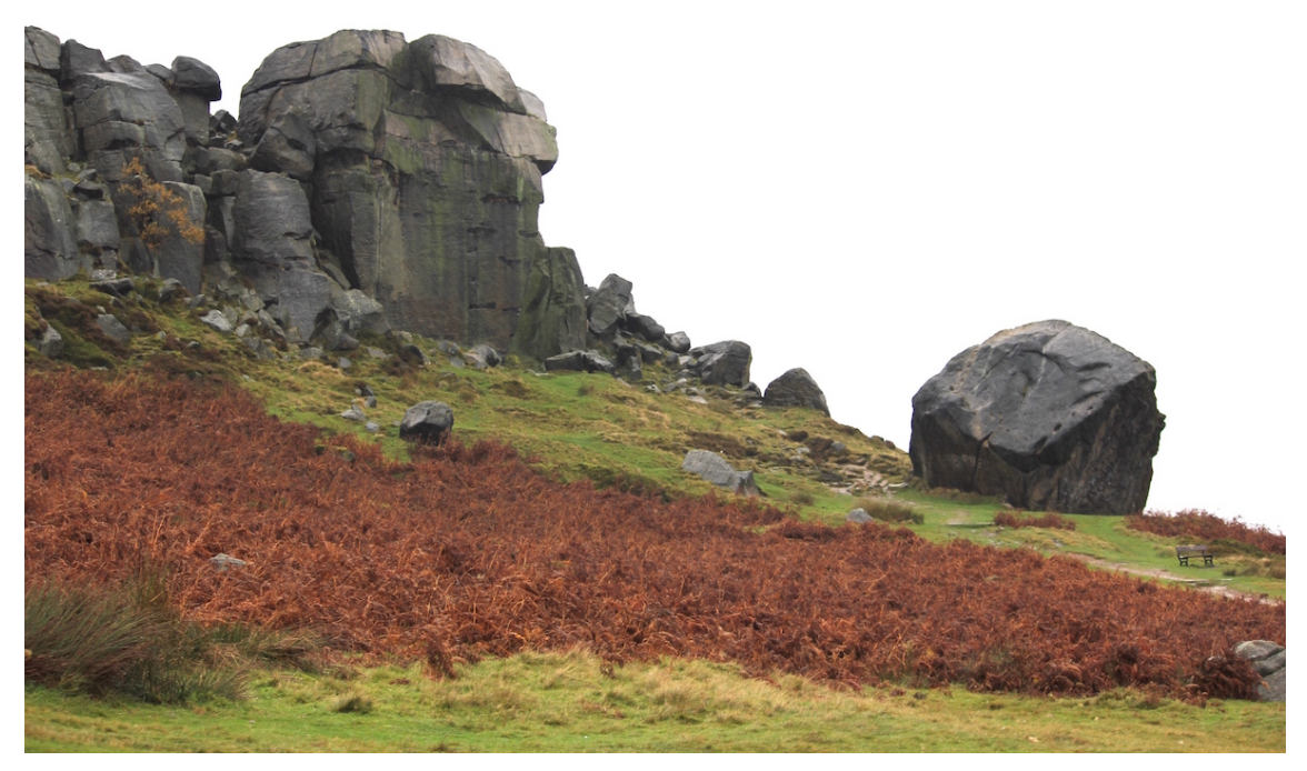
Figure 2. Cow and Calf Rocks on Ilkley Moor.

A year after the Oxford Conference, Rudolf Steiner returned to Britain to progress the Waldorf project: "The Ilkley conference is being arranged in order to give parents, teachers and educationists further opportunity for studying this new educational impulse that can be worked out anywhere, in a manner suited to the peculiar needs of any special country or district" (Ilkley Gazette, 1923b, p.5).