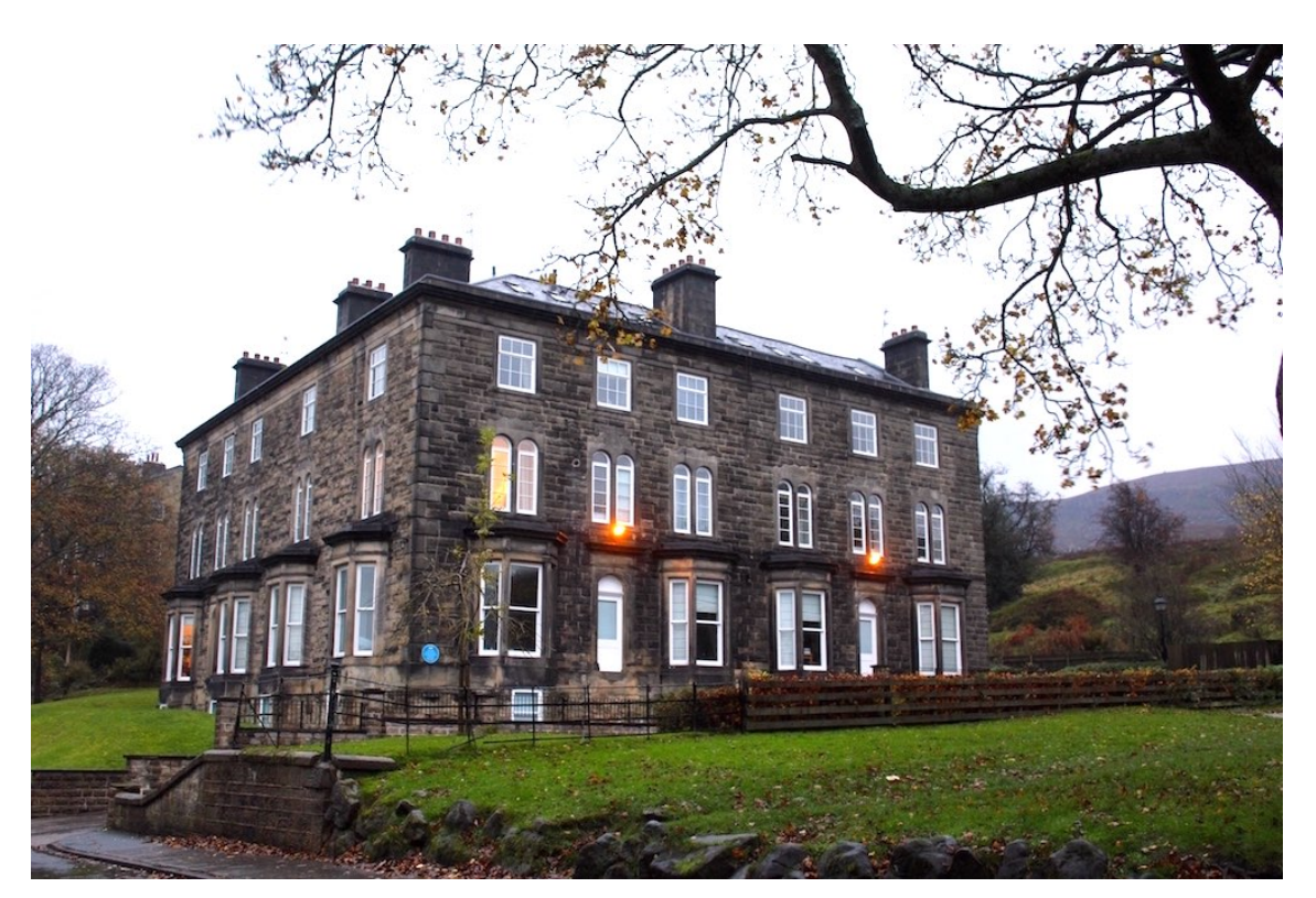
Figure 1. Rudolf Steiner stayed at Hillside on the edge of llkley Moor.

In the first of thirteen lectures, Rudolf Steiner told his audience: "We have gathered together in a beautiful spot in the North of England ... You have given up your summer recreation ... I cannot adequately express my gratitude for the fact that you have dedicated your holidays to the study of ideas for the good of the future" (Steiner, 1928, p.32).