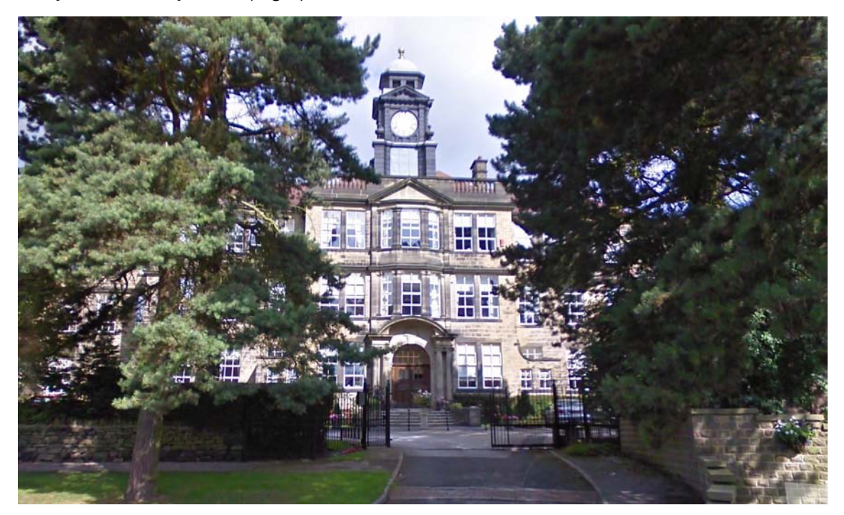
Figure 5. Rudolf Steiner delivered one lecture at the nearby Teacher Training College at Bingley.

An exhibition of handicraft works of Stuttgart students was presented of "various paintings, modelling, and toys and other handwork which had been made by the children" (15 August) (Yorkshire Observer, 1923a). Rudolf Steiner delivered an evening lecture at the Teacher Training College at Bingley (10 August), 16 km (10 miles) from Ilkley across Ilkley Moor (Fig.5).