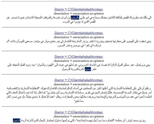
Figure 3: screenshot of the results of the annotation

The process pipeline starts with segmentation and the annotation process is then called, the results are directly displayed in a base of annotated segments, according to their classification in the semantic map. The user can then navigate between the base and the original sources, or carry out a search by keywords on various spaces defined by the segmentation or by the places of the markers in segments, i.e. the content of quotation, the place of speaker, the theme of quotation... In figure 3, the base of annotations contains quotations annotated in Arabic, the user filters only those having the annotation of "opinion" of speaker, on which he carries out a request with the keyword "رسوم" / drawings).