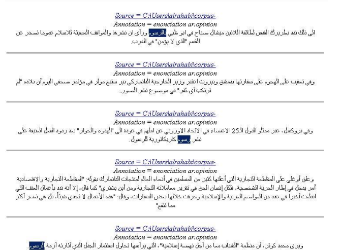
Figure 3: screenshot of the results of the annotation

The process pipeline starts with segmentation and the annotation process is then called, the results are directly displayed in a base of annotated segments, according to their classification in the semantic map. The user can then navigate between the base and the original sources, or carry out a search by keywords on various spaces defined by the segmentation or by the places of the markers in segments, i.e. the content of quotation, the place of speaker, the theme of quotation...In figure 3, the base of annotations contains quotations annotated in Arabic, the user filters only those having the annotation of "opinion" of speaker, on which he carries out a request with the keyword "رسوم" / drawings).