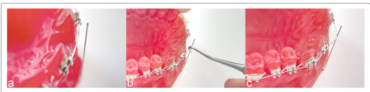
Fig. 1 a An identical set up as in the study of Alobeid et al.: Acrylic resin model (Palavit G 4004; Heraeus Kulzer, Hanau, Germany) was fabricated from a duplicate of a Frasaco model (Frasaco, Tettnang, Germany) of a normal maxillary arch. The upper-right, central incisor was removed. The model was bonded with conventional brackets with 0.022" slot size (GAC Twin, Dentsply Sirona, Charlotte, USA). A 0.014" Thermaloy-NiTi arch-wire (RMO, Denver, USA) was inserted. The stainless steel ligatures used were tied using a needle holder. The ligature was first tightened around the bracket wings and then loosened by one turn, to allow free movement of the arch-wire. b The reference pin was placed at a distance of 2 mm from the arch-wire. c The simulation was carried out at an ambient temperature of 36°C. A horizontal displacement of 2 mm was simulated. At the end of the displacement, the wire was stuck, because of friction and binding, and did not move back at all (correction = 0%). Alobeid et al. reported a correction of 1.6 mm, equal to 82%

Wiechmann et al. Head & Face Medicine (2020) 16:7 Page 3 of 5