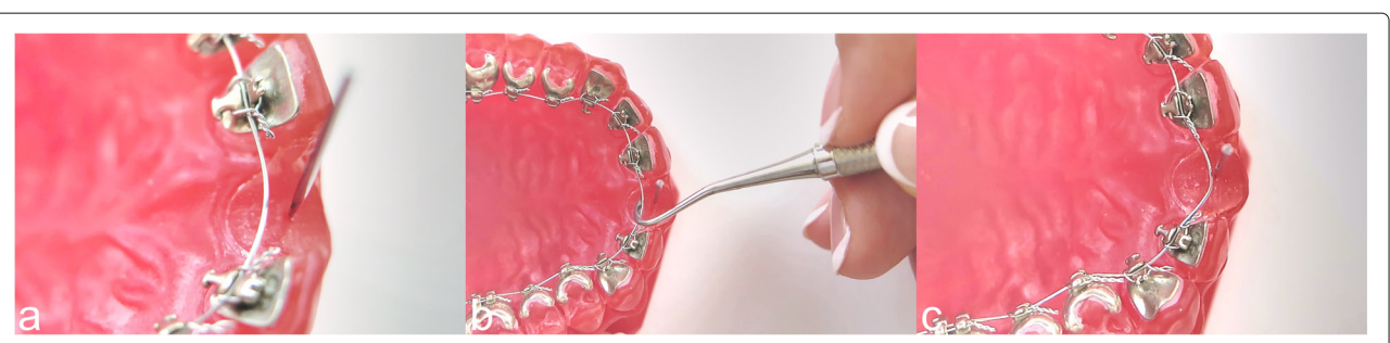
Fig. 2 a An identical set up as in the study of Alobeid et al.: Acrylic resin model (Palavit G 4004; Heraeus Kulzer, Hanau, Germany) was fabricated from a duplicate of a Frasaco model (Frasaco, Tettnang, Germany) of a normal maxillary arch. The upper-right, central incisor was removed. The model was bonded with completely customized lingual brackets with a 0.018" slot size (Incognito, 3M Deutschland, Neuss, Germany). A 0.014" lingual NiTi arch-wire (RMO, Denver, USA) was inserted. As RMO only offers straight lingual arch-wires, these were used in the simulation. The stainless steel ligatures used were tied using a needle holder. The ligature was first tightened around the bracket wings and then loosened one turn, to allow free movement of the arch-wire. b The reference pin was placed at a distance of 2 mm from the arch-wire. c The simulation was carried out at an ambient temperature of 36°C (sauna). A horizontal displacement of 2 mm was simulated. At the end of the displacement, the wire was stuck, because of friction and binding, and did not move back at all (correction = 0%). Alobeid et al. reported a correction of 0.6 mm, equal to 35%

In the materials and methods section, in particular, errors and flawed information appear. The authors do not even take the trouble to carefully describe how the measurements were made, but simply refer to earlier studies from the same source. Moreover, text passages and protocols sourced in earlier work by a similar group of authors are incorporated uncritically, which was bound to lead to quite obvious errors in taking measurements: "In addition, a calculation of the tooth movement vector was mathematically analyzed considering the centre of resistance of the upper central incisor tooth to be located at 10 mm apically from the centre of the brackets and was located 4.5 mm palatally from the point of application of force ..."