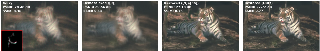
Figure 4: Restored examples with a 65 \times 65 blur kernel and noise parameters set to \lambda_s = 10^{-3} and \lambda_r = 1.3 \times 10^{-6} . Better seen on a computer screen. Both quantitatively and visually our method outperforms the two-stage method [9]+ [35].

Robustness to larger kernels. We train the different models with 25 \times 25 kernels but we show in Fig. 4 that our method can be used with much larger filters. The image is blurred with a 65 \times 65 kernel from [22]. We compare the two-stage strategy [9]+ [35] to ours, both trained with the “lin/lin” setting. Our method achieves a better PSNR score and visual aspect compared to the two-stage method. This is typical of our observations on other large kernels from [22].