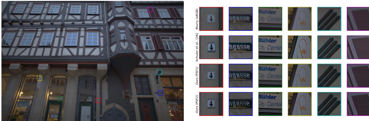
Figure 5: The real blurry image of [28] was taken with a modern digital SLR and a zoom lens at maximal aperture, exhibiting chromatic aberrations, especially on the corners where the lens is the most curved. Our method efficiently removes the blur caused by the optics, provided either a calibrated or an approximate PSF (best seen on a computer screen).