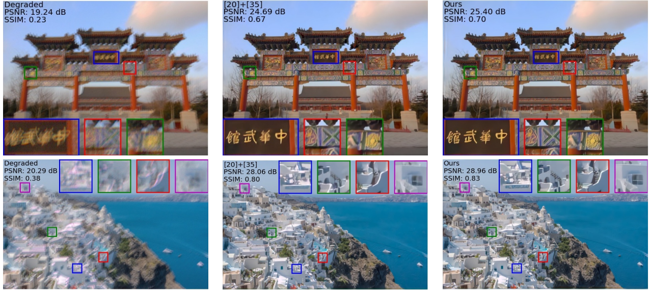
Figure 3: Examples of jointly deblurred, demosaicked and denoised images. We show the degraded raw images in the sRGB format. Compared to the two-stage method [20]+ [35], our method restores finer details.