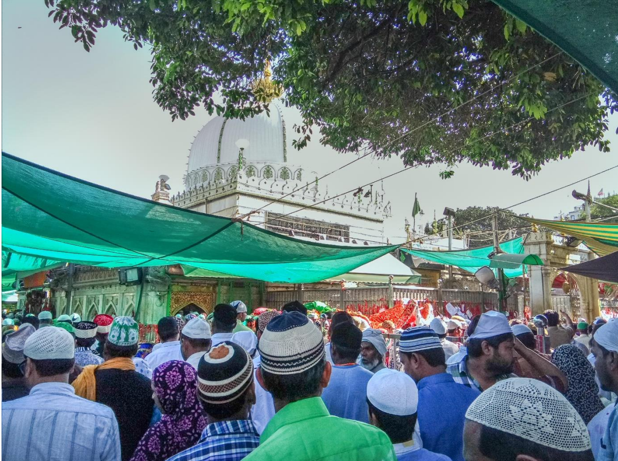
figure 1: Muslim pilgrims pray facing the tomb of the Sufi saint Muinuddin Chishti, in the city of Ajmer in Rajasthan. Sufi saints and their descendant claim to descend from Prophet Muhammad, and are thus designated as “sayyid”, the name of group that generally tops the symbolic social hierarchy.

Keywords: minority politics, associations, Islam, caste, India