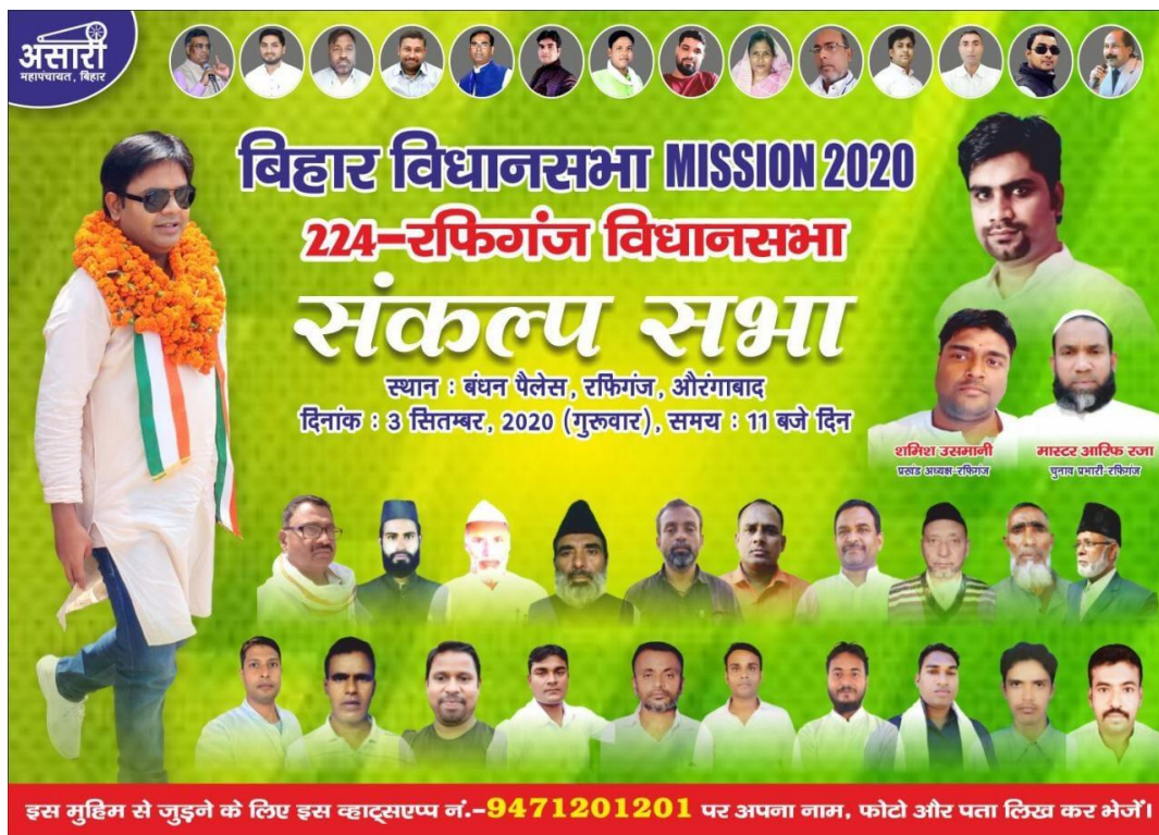
figure 4: The Ansari Mahapanchayat was founded in 2019, ahead of the elections in the Indian state of Bihar, and seeks to represent Muslims of the weaver caste group (Momin Ansari).

However, this form of “identity politics” has so far failed to make a dent as an electoral force. The recent legislative assembly elections in the Indian state of Bihar are a case in point. Although this state has historically been at the forefront of pasmanda mobilizations and in spite of the recent creation of a new organization ahead of the elections, very few candidates from pasmanda groups fielded by political parties and only three were actually elected. In many ways, the voting pattern of Indian Muslims thus remains largely determined by the wish to oppose the party currently in power.