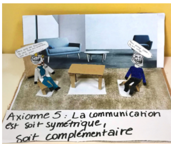
Fig. 6. The five communication axioms at work in a doctor-patient consultation situation.