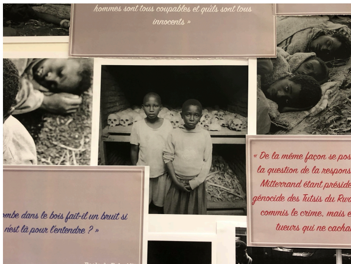
Fig. 2b. Archival images and texts on the Rwandan Genocide exhibit.