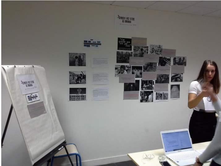
Fig. 2a. The Rwandan genocide exhibit.

themselves who were part of their own exhibit. This created a multimedia “surround” effect in line with what the Committee for National Morale sought to achieve by taking inspiration from the Bauhaus movement. The overall impression conveyed by this exhibit was that of a mise en abyme .