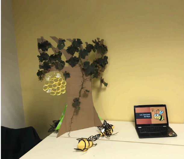
Fig. 3a. The beehive ecosystem.

information and communication situations that arise as the bees buzz around to accomplish their daily tasks (see Fig. 3 hereafter). A laptop was placed besides the tree on which the students displayed pictures of their exhibits and materials explaining the beehive ecosystem.