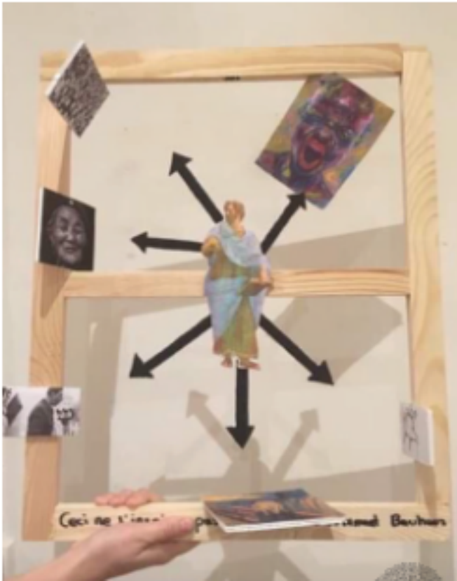
Fig. 5. The art of rhetorics and the manipulation of the masses.