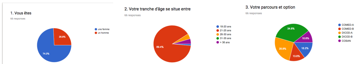
1. Fig. 1. Answers to questions 1-3. Socio-demographics of respondents.