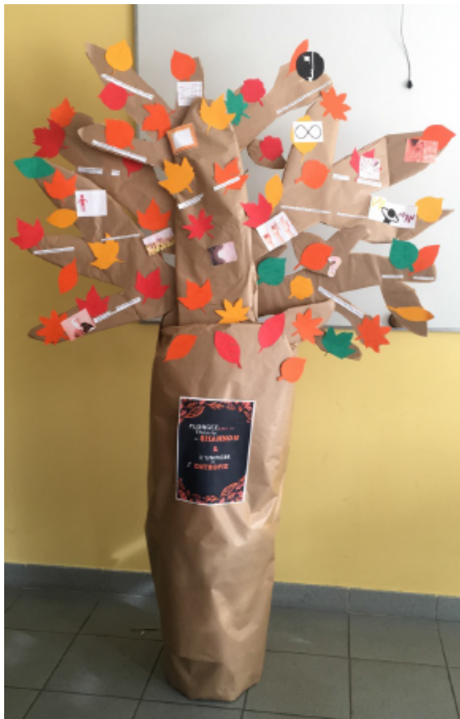
Fig. 1. ENTROPIA. The Tree of knowledge.

The overall aim of this exhibit was to convey how knowledge is acquired incrementally, over time, through interactions with existing knowledge artefacts and with our environment (people and things).