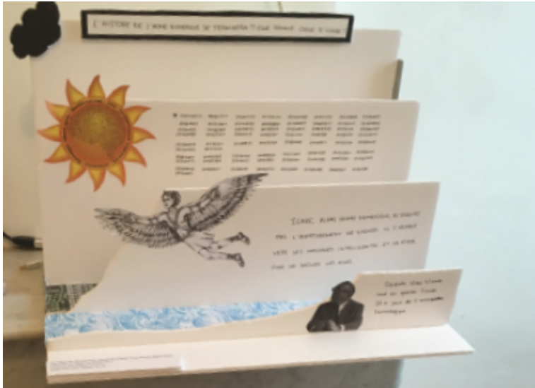
Fig. 4. The myth of Icarus ( Homo Numericus ) or the dangers of AI.

into a technological armageddon. The continuous aspect of the burning wings in the display was intended to convey the fact that we do not yet know the end of the story: will humans ultimately be controlled by the machines they built? The future will tell.