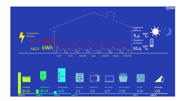
Fig. 4. Educational Simulation

for room heating. It can then see how minimal changes on such parameters impact the energy consumption. The demonstration will present the creation of a household and show the difference between a base case scenario and a modified configuration (Figure 4).