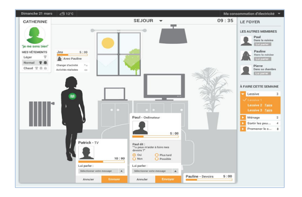
Fig. 3. Participatory simulation interface

Thanks to this interface, the user can easily configure a household and set up consumption habits and general policies such as the setpoint temperature