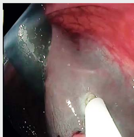
► Video 1 Snare shape depending on pressure and an example of the procedure.