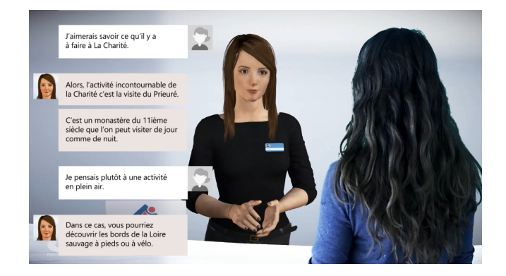
Figure 1: Conversational interface.