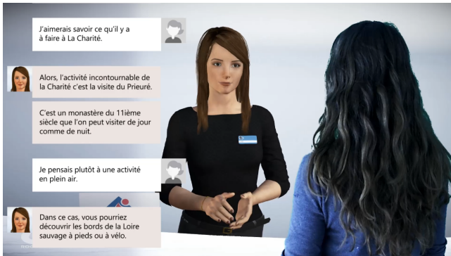
Figure 1: Conversational interface.