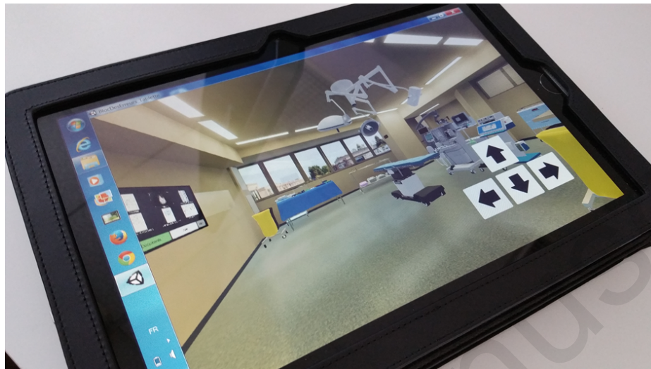
Photo of the virtual reality environment on tablet