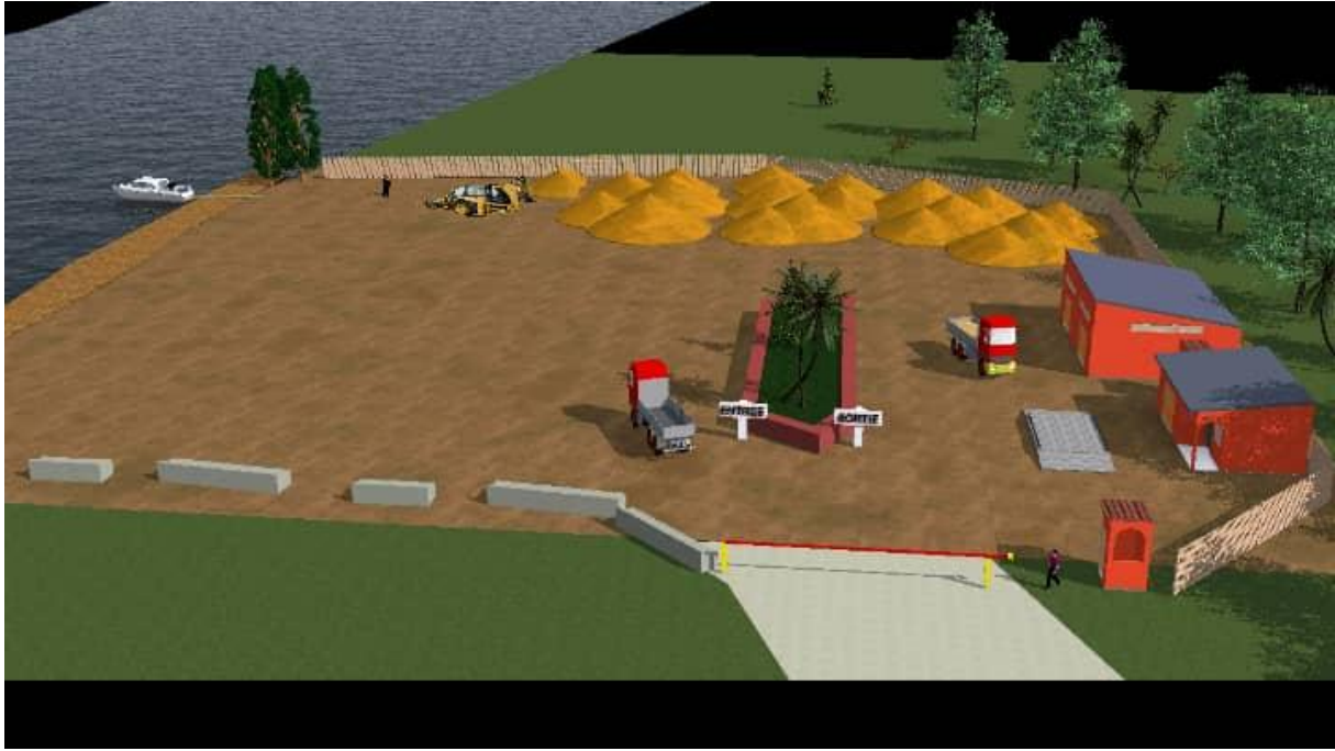
Figure 3: Proposed mechanized model (3D) of Nkol'Ossananga sand harvesting for sustainable exploitation.