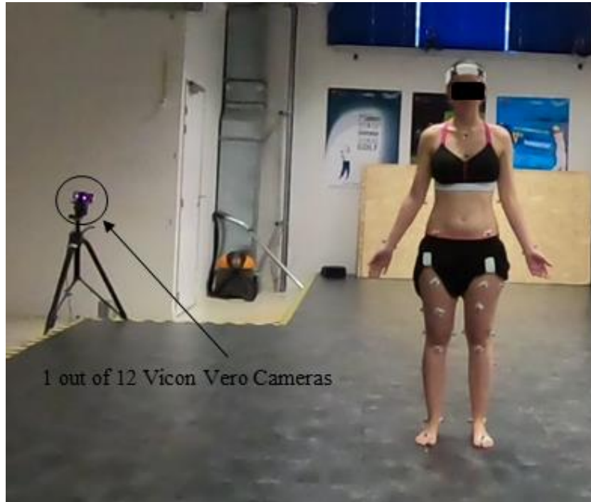
Figure 1. One of the subjects standing in front of the stereo vision system (This image has been taken by the left camera of the stereo vision system).