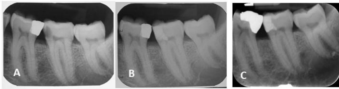
Figure 1: Radiographs of 48-year old male patient with signs and symptoms clinically suggestive of irreversible pulpitis and normal periapex in tooth 37 A: Preoperative radiograph, B: Immediate postoperative radiograph after partial pulpotomy using ProRoot MTA, C:5-year recall showing normal periapex.