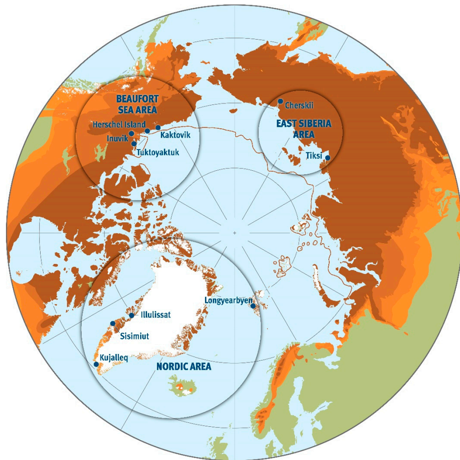
Figure 1. Map of Nunataryuk field sites. Lantuit, et al.; GRID-Arendal.

Hence, our proposed risk framework is the result of a collaborative and multidisciplinary process. The framework presented is applicable to the full spectrum of disciplines covered in the Nunataryuk project. “Nunataryuk” is based on the combination of two words: the Inuvialuktun—the Inuit language of the Inuvialuit of northwest Canada—words, “nuna” which means “land”, and “taryuk”, which means “coast” (the spelling of the latter word differs from dialect to dialect). While the combination of these two words does not exist in Inuvialuktun, its creation is based on conversations the project leadership had with Inuvialuit knowledge holders in developing the project. “Nunataryuk”, which thus could be translated as “from land to sea”, indicates the relevance of indigenous knowledge for the overall project but should not be misunderstood as privileging Inuvialuit knowledge over other forms of (indigenous) knowledge.