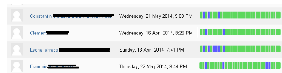
Figure 3: The Progress Bar block / overview of students (partial)

To boost students' motivation, we informed them that they would be able to download a free version of N.E.P.T.U.N.E, the maritime English software we have created, upon completion of the course with a score of 80% or more for each quiz.