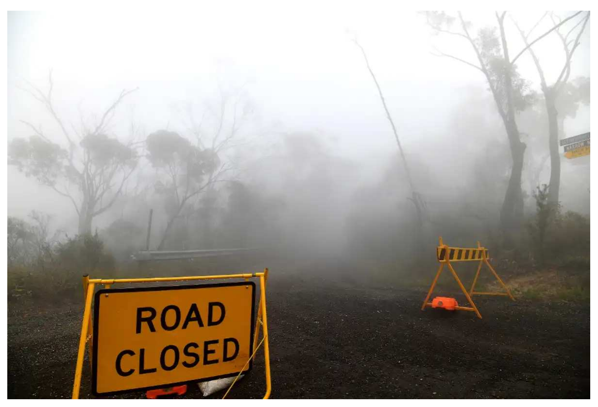
In January 2020, in the vicinity of Sydney, a thick fog due to massive fires devastated large parts of the Australian territory.

France, but is essential to gaining a better understanding of the complexity of the modern world and finding more comprehensive solutions to the economic, social and environmental challenges facing our societies.