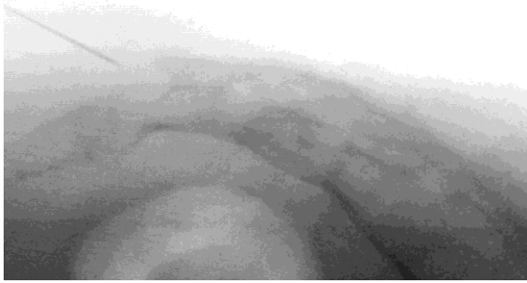
Fig. 1. Initial positioning of the needle at 45° relative to horizontal.