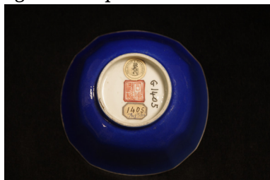
Fig. 8: Bowl, China, kilns of Jingdezhen (Jiangxi). Qing dynasty, Tongzhi period (1861-1875), 6,5 x 12,5 cm, mark “Tongzhi nian zhi”. Paris, musée des Arts asiatiques - Guimet, inv. G1405

number of such cases raises questions about the role of dealers as intermediaries, in the light of the previous considerations about their relationship with the collector. Mer-