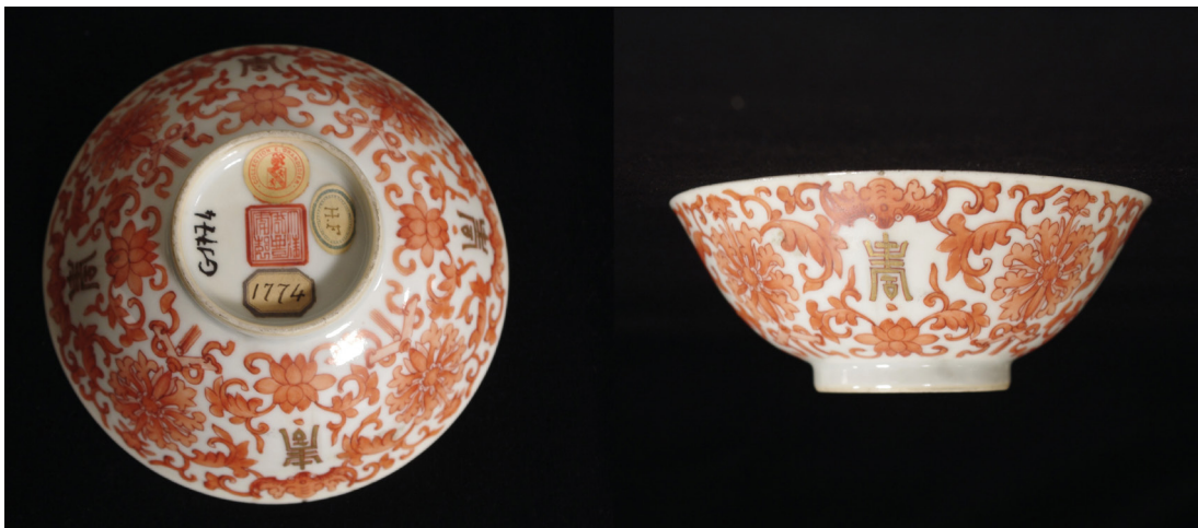
Fig. 4: Bowl, China, kilns of Jingdezhen (Jiangxi) Qing dynasty, Xianfeng period (1851-1861), porcelain, 5,5 x 12,6 cm, mark “Da Qing Xianfeng nian zhi” Paris, musée des Arts asiatiques – Guimet, inv. G1774